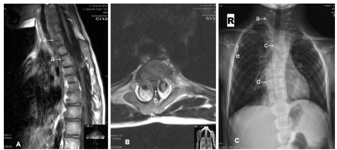
Figure 1. A; cervical fusion anomaly (a), B; hemi vertebra (b), C; bone septa image of diastematomyelia (c), scoliosis (d), high scapula (e)

First case of KFS is 6-year-old female patient, first child of a 25-year-old mother (Gravidity3, Parturition2 and Alive2). Parents have not relationship and chronic diseases. Her parents age were 25-year-old. Her mother did not take any drugs during her pregnancy. She was born with normal spontaneous vaginal delivery (NSVD) at 40 weeks gestation. Patient's weight was 18 kg (lower than -0.67 SD) and her length was 112 cm (lower than -0.35 SD). She had normal mental level. Recurrent urinary tract infections and complaints in patients admitted to the pediatric surgery clinic with fecal incontinence were assessed as secondary to both constipation and there was no surgical pathology in patient. The patient's complaints improved with constipation and anal fissure treatment. Chest X - ray was showed Sprengel deformity (also known as High scapula) and cervical fusion anomalies. MRI, which was taken due to left shoulder impairment and scoliosis was present at the cervicothoracic level, and was consistent with the intramedullarv syringohydromyelitis at the Th7-8 level, and was posterior fusion and anterior hemi vertebra at the C7-Th1 level. Also there was increase in the diameter of the vertebrae and spinal canal at the C3-4 level, and was a hemi vertebra view at the posterior of Th4-5 and a spinal canal at the midline of the bone septa (Diastometamyelia) (Figure 1).