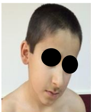
Figure 1: Torticollis view of the patient before surgery

Spinal MRI showed a large cystic lesion arising from the posterior parts of the vertebrae, with fluid levels causing prominent mass effect on the spinal cord at T4-5 level (Figure 2a, 2b). Histopathological examination revealed an aneurysmal bone cyst. The patient underwent emergency surgery; total tumor resection was performed, and no postoperative complications were observed. After the surgery, the patient immediately recovered from the neck pain. In the first 24 h, the patient started walking using a crutch and his torticollis improved. On the 15th postoperative day, the patient started walking without support and his focal neurological deficit improved. No signs or symptoms of neurological dysfunction were observed in the 1-year postoperative follow-up visit.