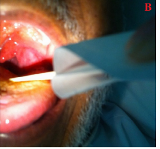
Figures (1A and 1B): throat examination of the patient revealed the left tonsil enlarged and erythematous with the uvula deviated to the right side.

ric tonsillar hypertrophy, and cervical lymphadenitis on examination of the tonsils. The diagnosis mostly depends on history and physical examination. Besides, medical imaging like a Computerized tomography scan and ultrasound can be done to confirm suspected cases or to rule out complications. The management includes removing pus through aspiration, incision, and drainage or tonsillectomy, with particular attention that should be made for maintaining the airways. Additionally, pain medication, antibiotics, steroids, and hydration should be provided where hospital admission is not generally essential<sup>3</sup>.