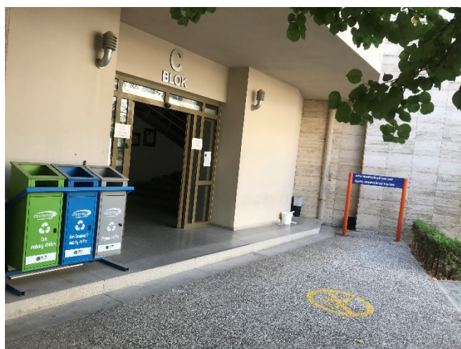
Figure 2. Non-hazardous recyclable waste collection containers (metal, paper, plastic) placed on the campus area of Mersin University

Therefore, all employee responsible for waste management at different departments have been trained on two main title 'MEU Hazardous Waste Management System and Hazardous Waste Management in Laboratories'. In the training activities, subjects were detailed as the identification of hazardous waste, classification, transportation, storage of them, control procedures, information on regulations, and precautions to be taken in case of emergency were included. In addition, the waste collection containers placed on the campus area of Mersin University for non-hazardous packaging waste were also introduced and the importance of recycling and the concept of zero waste was mentioned (Fig. 2) With this training activities, it is planned to increase environmental awareness, support zero waste studies and manage hazardous wastes on campus area at Mersin University.