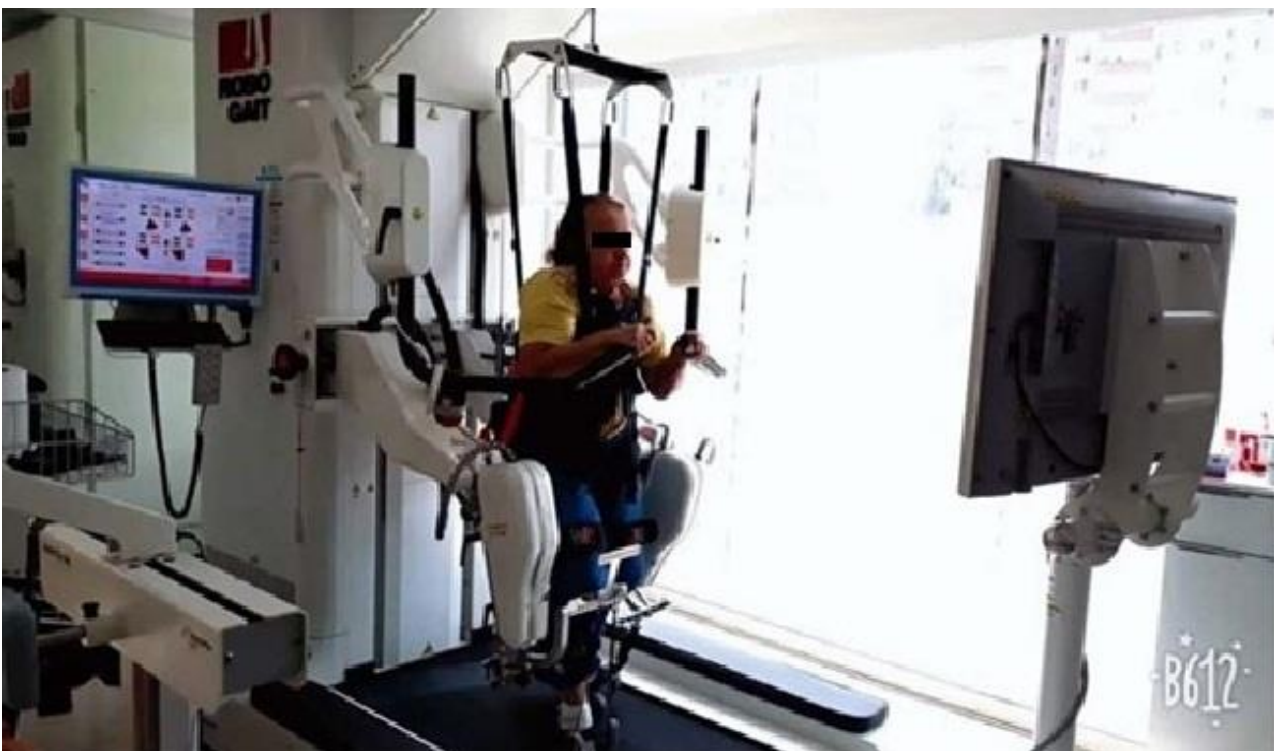
Figure 2. Lower extremity robotic practice