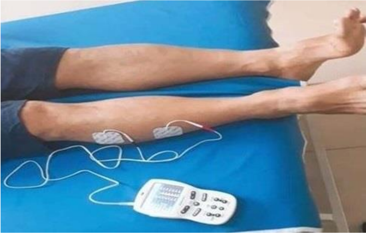
Figure 1. EMG-BF measurement.

minutes Electrical Muscle Stimulation were implemented to the third group on 15 times. EMG-BF (EMG biofeedback portable tool brand NeuroTrac® MYOPlus having 2 channel EMG as well as 4 channels of NMES, and 2 channel EMG triggered stimulation with stimulation on 4 channels (Figure 1-2).