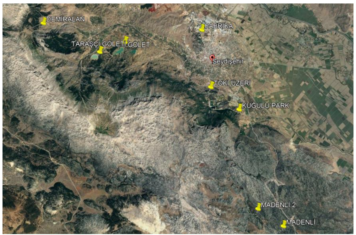
Figure 1. Research area

Field studies in the town of Seydisehir were carried out between 2015 and 2017 in the autumn and spring months when the macrofungi were most active. In the preliminary study, the geographic structure of the research area and the suitable environments for fungi were determined (Figure 1).