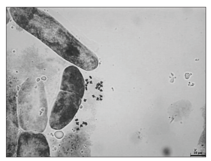
Figure 2. Photomicrograph of metaphase chromosomes of Silene muradica (Scale bar: 10 µm).

hope that this study will contribute to future karyological studies of the genus Silene .