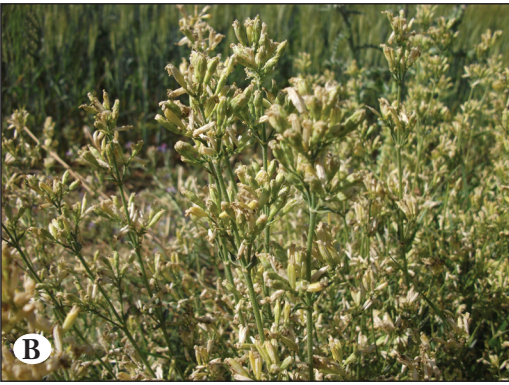
Figure 1. Silene muradica in natural habitat. At preflowering stage (A), and at fruiting stage (B).