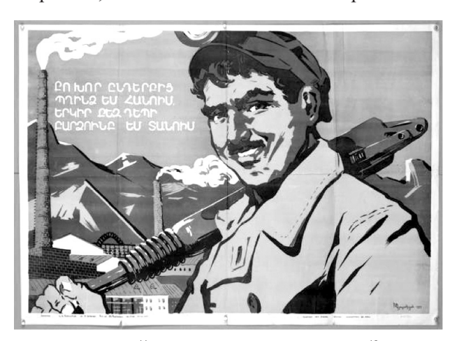
Poster 6<sup>44</sup>: The Propaganda Poster on Soil<sup>45</sup>

The propaganda poster on soil was created by Khachatur Hovhannesi Gyulamiryan in 1959. Considering the expressiveness function, the poster depicts a man holding a work tool with a proud attitude. The perception that the male is a mine worker is inferred through the visual codes in the poster. As in the other posters, it is seen that the man in this poster is smiling.