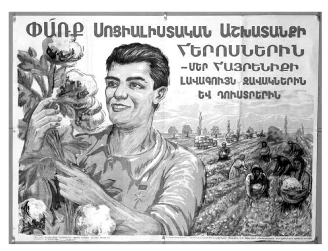
Poster 1<sup>34</sup>: The Propaganda Poster on Heroism<sup>35</sup>

UUՌ Մինիստրների սովետին կից Կուլտուր-լուսավորական հիմնարկների գործերի կոմիտե) within the Armenian SSR Council of Ministers. When examined in terms of expressiveness function, it is seen that there are workers working in the cotton field in the poster. In the centre of the poster, there is an image of a man picking cotton. Visual codes reflect that the male holds the cotton seedling and smiles. It can be seen that there is also a medal on the left side of the man's chest.