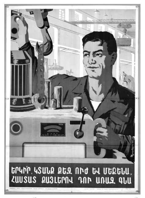
Poster 5<sup>42</sup>: The Propaganda Poster on Life<sup>43</sup>

The life propaganda poster was prepared by Khachatur Hovhannesi Gyulamiryan in 1956. When examined in terms of expressiveness function, a man is depicted in the poster as operating a machine in boiler suit. It is seen that the man in the poster is smiling. From the visual codes on the poster, it is perceived that the place where the man is located is a factory.