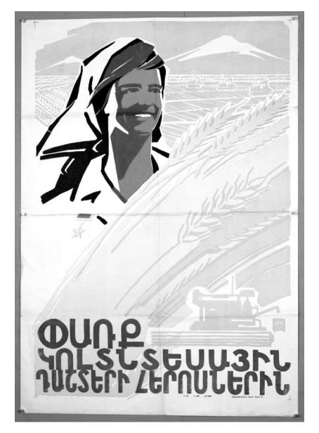
Poster 7 <sup>46</sup>: The Propaganda Poster on Collective Farm<sup>47</sup>

The propaganda poster on the Collective Farm was prepared in 1970. There is no information about the artist of the poster. When examined in terms of expressiveness function, it is seen that wheat ears are positioned in the centre of the poster. There is an image of a smiling woman in overalls on the wheat with a star-shaped medal on her left chest. Under the wheat are images of a harvester and a truck. There is a mountain image on the background of the poster.