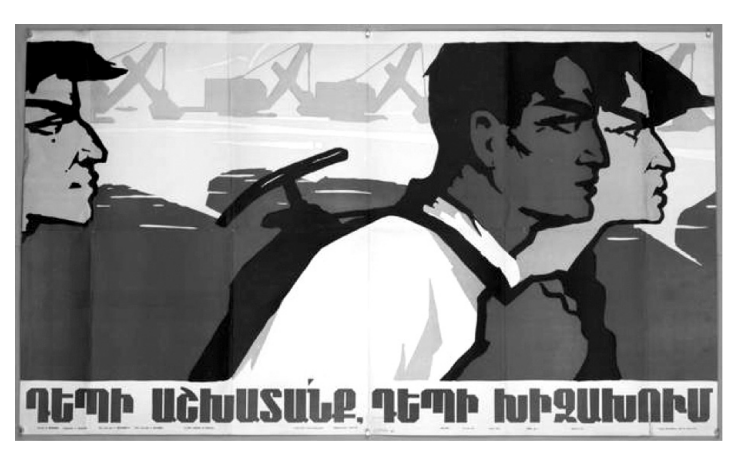
Poster 4<sup>40</sup>: The Propaganda Poster on Courage<sup>41</sup>

The propaganda poster on courage was prepared by Aram Borisovich Zakaryan in 1958. Considering the expression function dimension, it is seen that there are three visuals of men moving in one direction in the poster. One of the men in the poster is depicted with a bag on his back and a hammer-like tool inside the bag. When examined through visual codes, it is seen that men have a determined facial expression. On the background of the poster, there are indicators that create a perception that the place where the men are located is a mine.