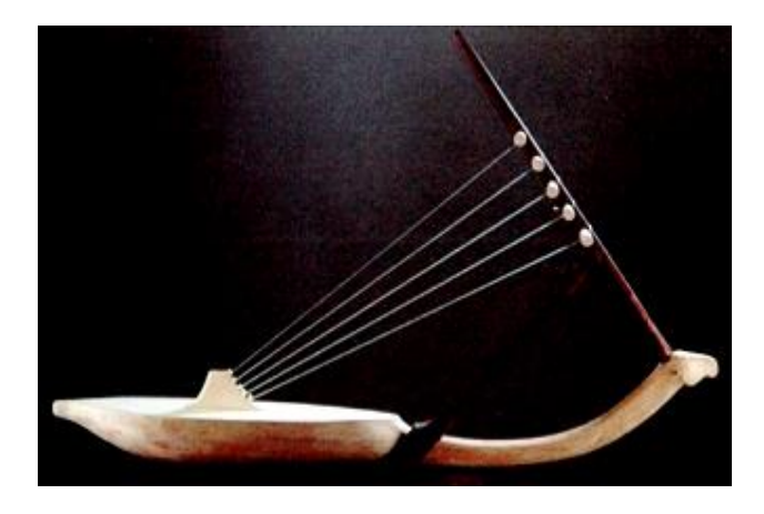
Figure 6. German artist's work

Based on the mountains of Altai Mountain, in the snow-covered Mongolian cave tomb is famous musicians, epic poet Churee. As a model of his own musical instrument was created based on the Mongolian tovshuur and morin khuur structure. He made a new and innovative approach to the way of say and play the music feature. This is a proof in the Musical Instruments: <<Play the String instrument music, written by Churee>> /Created/. For this reason, the two-string latches we consider to be the ancestor of the Mongolian morin khuur music is a type of bow instrument.