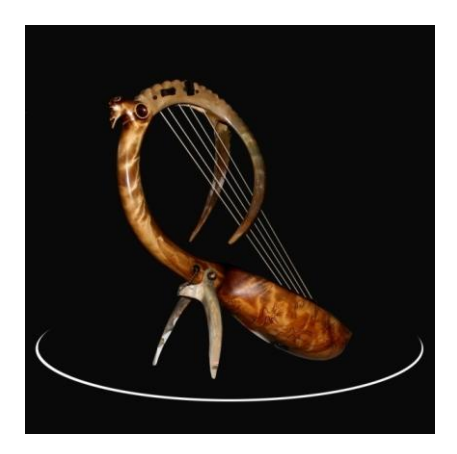
Figure 7. Mongolian artist's work