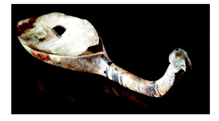
Figure 8. Tovshuur

Another important evidence to connect with the musical instrument in the rock painting /petrography/. The work of the old-fashioned artist`s who have survived the rocks<sup>7</sup> - the issue of the many tribes living in our country - is engraved on the musical instruments for what reason, on the tovshuur musical instrument`s woodblock more like the rock painting.