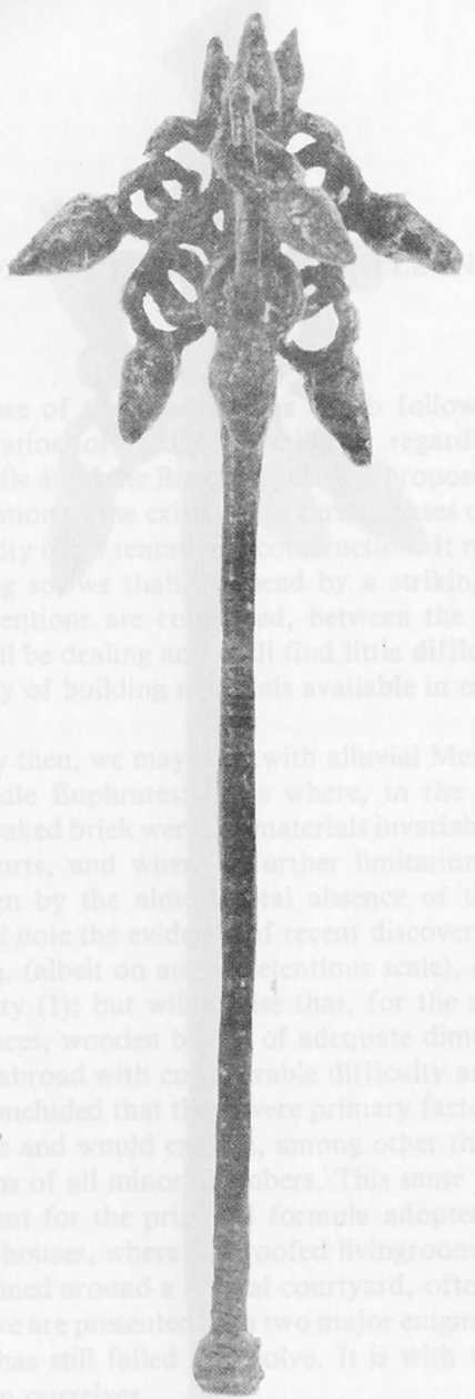
Pl. 1 Bronze standard from Maa-Palaeokastro.

First then, there is the question of interior lighting. Where dwelling-houses in the Middle East are concerned, ground-floor windows in the exterior walls are (at this day) avoided, but