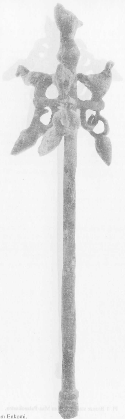
Pl. 2. Bronze standard from Enkomi.