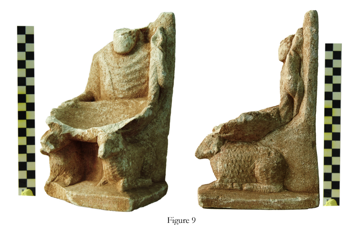
a b c d