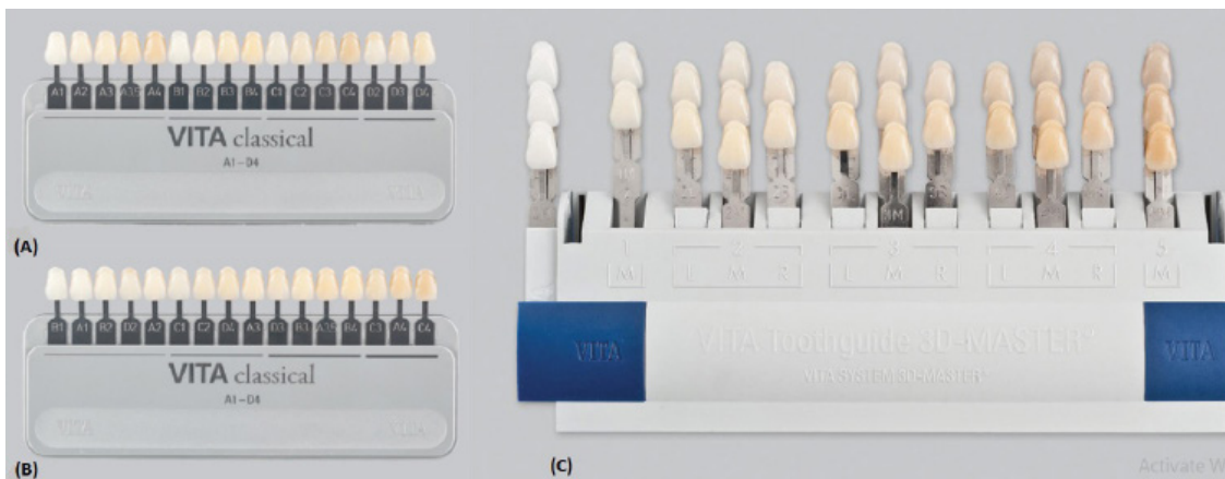
Figure 3. (A) Vita classic A-to-D tab arrangement; (B) value scale; (C) VITA Toothguide 3D-Master (19).