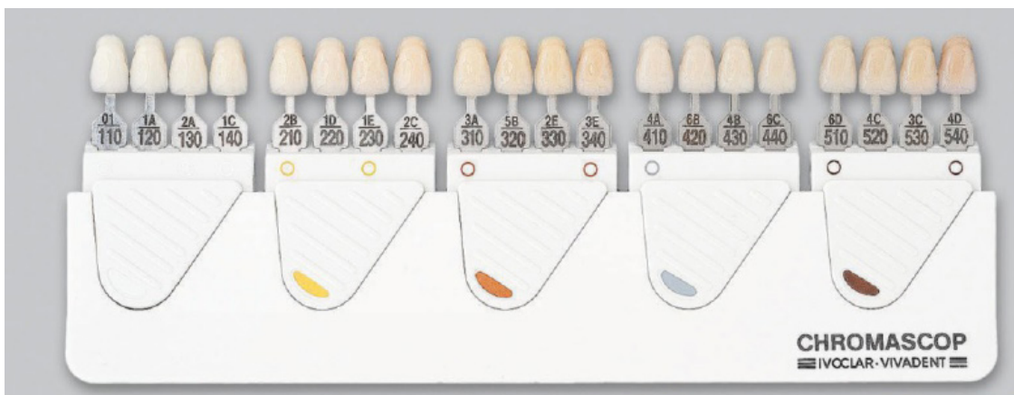
Figure 4. Ivoclar Chromascop guide (19).