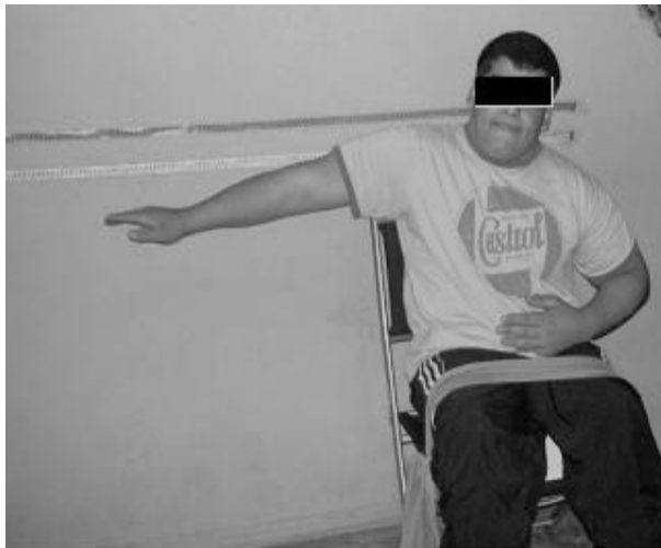
Figure 4. Lateral reach test.

For players with; • Class 3.5-4.5; Modified functional reach test, bilateral reach test and lateral reach test. • Class 2.5-3; Modified functional reach test and bilateral reach test. • Class 1-2; Modified functional reach test was assessed.