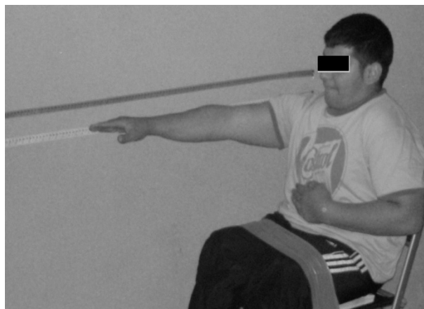
Figure 2a. Modified Functional Reach Test starting position.

The anatomical landmark used to measure reach was the ulnar styloid process. The ulnar styloid process is a prominent landmark and was proximal enough to allow accurate measurements to be taken for all players. 2 Subjects were instructed to reach as far forward as possible without losing balance. This distance was recorded as functional reach. 10 No compensatory activities like shoulder protraction and neck flexion is wanted during forward reach. Subjects were to move as far as possible and hold the terminal position for 3 seconds. 8 The players were guarded for safety and the trial was repeated if the player required assistance to recover. Each player had one practice trial of maximal forward reach, followed by one trial during which data were collected. 2 The dominant upper extremity was used for forward reach. The contralateral hand was placed on the umbilicus, negating any upper extremity compensatory stabilization (Figure 2). 10 a-b)