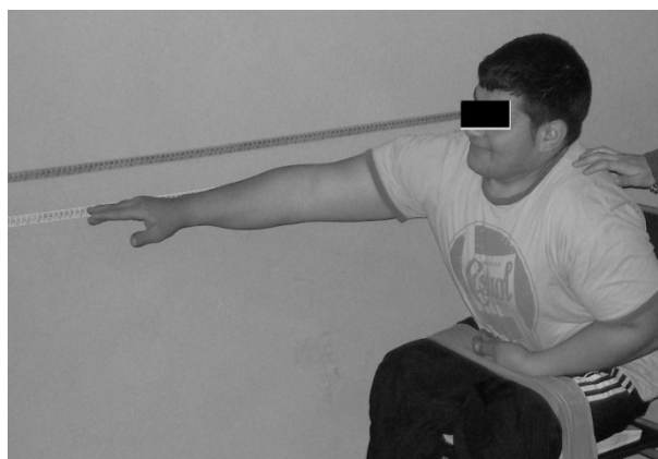
Figure 2b. Modified functional reach test evaluation position.

Bilateral Reach Test: Differently from modified functional reach test, bilateral reach test was tested with 90° bilateral shoulder flexion. Subjects were instructed to reach as far forward as possible without losing balance. This distance was recorded as Bilateral Reach. 10 (Figure 3)