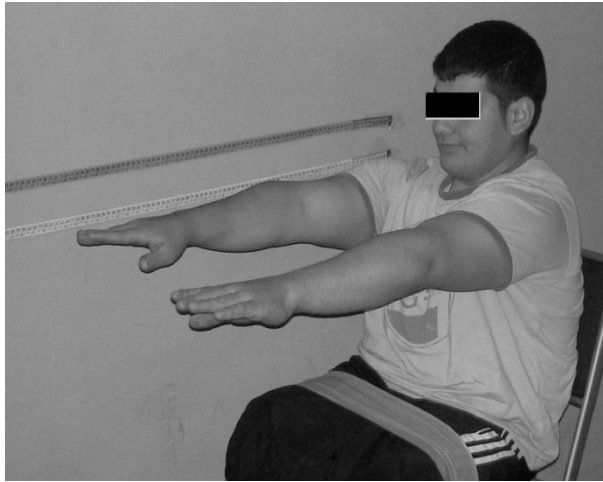
Figure 3. Bilateral reach test.