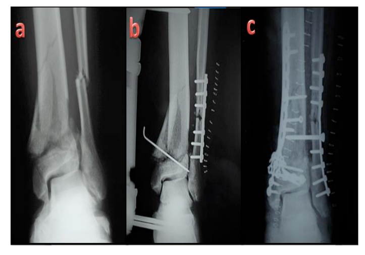
Figure 1: Staged fixation. a, Preoperative radiograph; b, First operation: EF+ Fibular plate; c, Early postoperative radiograph.

Twelve (60%) of the patients received staged fixation (Figure 1), while eight (40%) of them directly received open reduction + internal fixation (Figure 2) (Table 2). In three of the patients in whom staged internal fixation was planned, the treatment was continued with an EF applied in the first session.