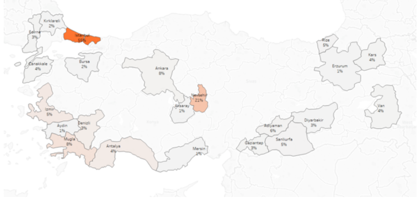
Figure 2. Most shared photos by cities

Perhaps the most prominent image of the Cappadocia region seems to be balloon travel. All bloggers visiting this area shared images of balloon travel (107) as well as photos of the Fairy Chimneys (95). Mugla and Izmir were generally popular with their rural areas or their districts rather than centres.