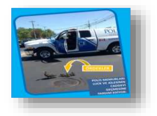
Figure 3. A sample from National Geographic Kids magazine in regard to the value of helpfulness.

In Figure 2 there is a visual material that is about the value of helpfulness. In the visual there a child helping her mother and both of them are happy in this situation. It can be stated that through this material the magazine attempt to acquisition of values of helpfulness to its readers.