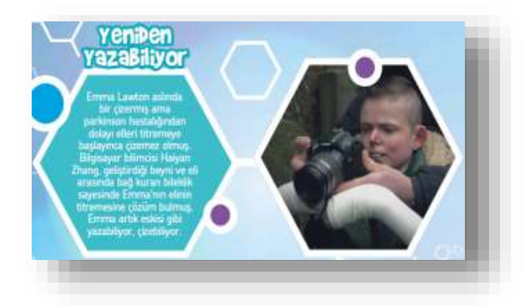
Figure 10. A sample text reflecting the value of helpfulness in TRT Çocuk Magazine (TRT Children's magazine) magazine , (Source: TRT Çocuk (TRT Children's magazine) , 2017, 01: 16).

The magazines analysed in the study contain both images and texts about helping people with disabilities. As can be seen in the figures above, the value of helpfulness is featured in magazines with all its dimensions. Helping the elderly, friends, disabled people, children and animals in different schools is discussed in the magazines. It can be said that there are many visuals and texts on the value of helpfulness in the children's magazines covered in the sample of the study. It may be suggested that teachers may benefit from children's magazines in relation to the learning outcomes in social studies courses and within the scope of the helpfulness value.