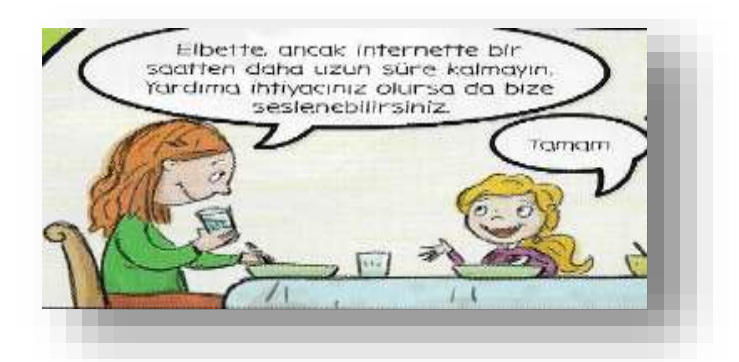
Figure 8. A sample text reflecting the value of helpfulness in Araştırmacı Çocuk (Researchers Kids) magazine, (Source: ACD, 2017, 6: 44).

The magazines also feature several examples of helpfulness in different countries in the case of natural disasters. In Figure 7 there is a photo showing the avalanche disaster in Italy and the efforts of the volunteers trying to help those injured in this incident. The importance of people with benevolence value becomes much more evident in major disasters such as the incident given in this example. Because individual efforts are not sufficient in such events, and acting collectively ensures that the troubles are resolved in a shorter time. Therefore, more individuals should have the value of helpfulness.