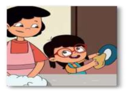
Figure 2. A sample from TRT Çocuk magazine in regard to the value of helpfulness

In Figure 2 there is a visual material that is about the value of helpfulness. In the visual there a child helping her mother and both of them are happy in this situation. It can be stated that through this material the magazine attempt to acquisition of values of helpfulness to its readers.