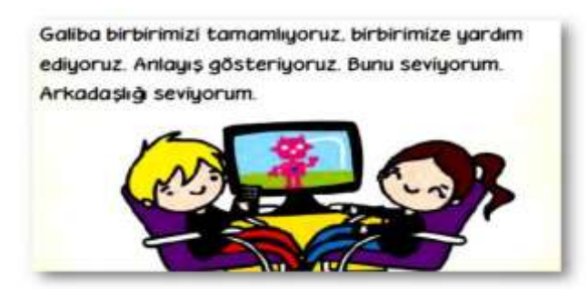
Figure 5. A sample text reflecting the value of helpfulness in Bilim Çocuk magazine.

Figure 5 depicts a piece used in the section of the magazine entitled "what is friendship?" In the text given in Figure 5, friendship is represented as a way to help each other, and the author expresses satisfaction with this situation. It is thought to convey the value of helpfulness to the readers.