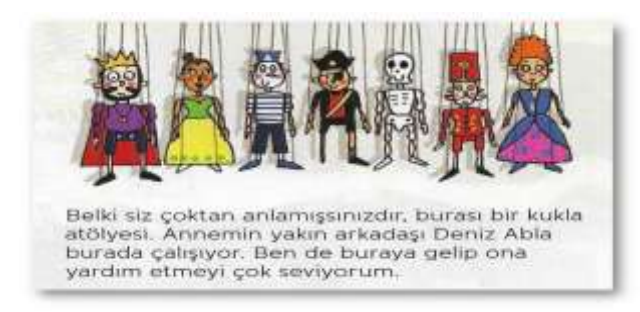
Figure 4. A sample from Araştırmacı Çocuk magazine in regard to the value of helpfulness (Source: AÇD, 2017, 1: 22).

Figure 3 depicts that Canadian policemen help a duck family passing the street. They stopped the traffic to enable them to pass the street. This shows that helpfulness is not limited to people, but it is also about other living beings. The news is supported by various materials which all contribute to the acquisition of values of helpfulness by the readers.