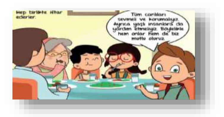
Figure 6. A sample text reflecting the value of helpfulness in TRT Çocuk magazine.

Figure 5 depicts a piece used in the section of the magazine entitled "what is friendship?" In the text given in Figure 5, friendship is represented as a way to help each other, and the author expresses satisfaction with this situation. It is thought to convey the value of helpfulness to the readers.