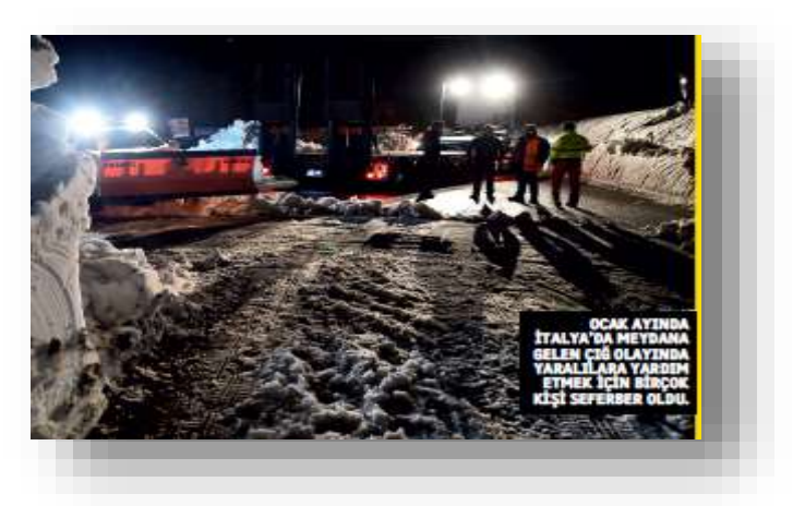
Figure 7. A sample text reflecting the value of helpfulness in National Geographic Kids magazine.

Figure 6 shows the happiness of children who help an elderly person, prepare an iftar table for her and do their best to have an iftar with her son. In addition, the positive effects of benevolence on people are expressed with the statements in the speech bubble. It can be said that these expressions are attempts to bring the value of benevolence among the audience.