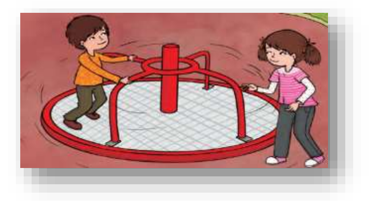
Figure 9. A sample text reflecting the value of helpfulness in Bilim Çocuk Dergisi ( Science Kids ) magazine , (Source: BÇD, 2017, 3: 13).

Figure 8 shows a part of the conversation between the mother and her daughter who asks for permission to do her homework. The mother, who gave permission to the child she requested, reminded her that she can get help from them if she needs. It is thought that giving such an example in the magazine is important in terms of presenting an opinion about the people whom children will receive assistance from.