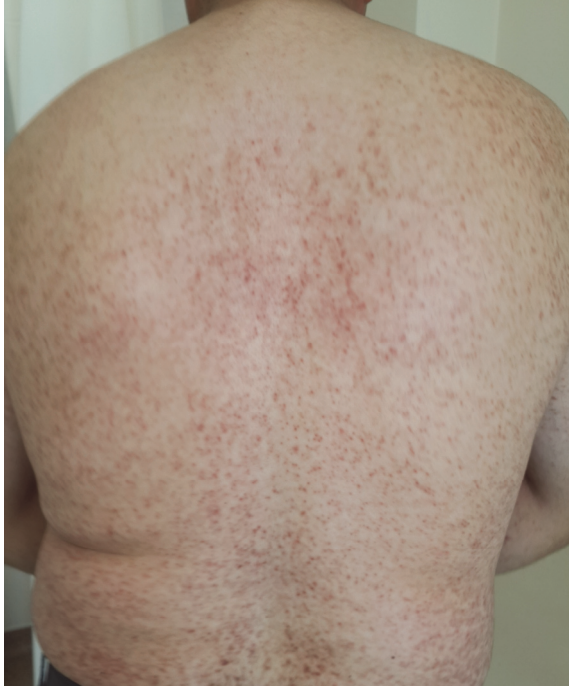
Figure 1. Reddish-brown maculopapular lesions on the back, axilla, shoulders, and arms.

maculopapular lesions on the back, chest, axilla, shoulders, and arms (Figure 1-2).