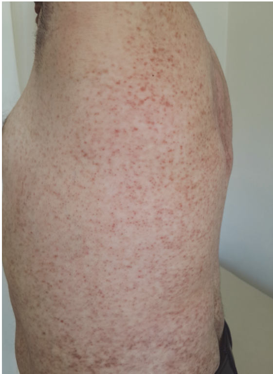
Figure 2. Reddish-brown maculopapular lesions on the chest, axilla, and abdominal region.

We detected telangiectasias in some of the lesions. Darier's sign was positive. Genital mucosa, oral mucosa, and the skin did not reveal any pathologies. The patient's body temperature was 37.1 ° C. His blood pressure was 130/90 mmHg with a heart rate of 111 bpm, and a respiratory rate of 17 rpm. The test results were as follows: erythrocyte count: 4,9 \times 10^6/\text{mm}^3 ; haemoglobin count: 14,5 g/dL; leucocyte count: 7,8 \times 10^3/\text{mm}^3 ; thrombocyte count: 276 \times 10^3/\text{mm}^3 ; ferritin: 83,4 ng/mL; erythrocyte sedimentation rate: 6 mm/hr; blood urea nitrogen: 15,8 mg/dL; creatinine: 0,7 mg/dL; uric acid: 5,6 mg/dL; AST: 20 U/dL; ALT: 27 U/dL; alkaline phosphatase: 57 U/L; glucose: 85 mg/dL; sodium: 139 mEq/L; potassium: 4,3 mEq/L; calcium: 9,9 mg/dL; phosphor: 6,3 mg/dL; total cholesterol: 182 mg/dL; triglyceride: 212 mg/dL; parathyroid hormone: 38,1 pg/mL; total protein: 8,0 gr/dL; and albumin: 5,0 gr/dL. Peripheral blood smear, urinalysis, prothrombin time, activated partial thromboplastin time were normal. No pathology was detected in the pelvis, vertebrae, ribs, skull, and long bone radiographs. Abdominal ultrasonography showed the liver and the spleen in their regular size. Having normal laboratory and physical examination results, liver biopsy was not considered.