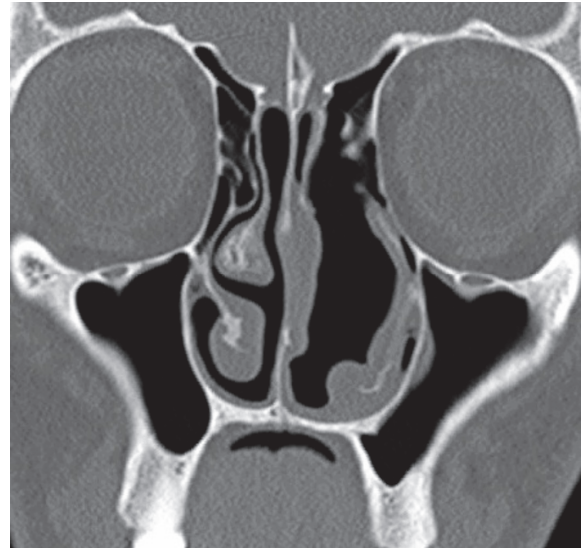
Figure 3. The normal CT image captured one month after the operation