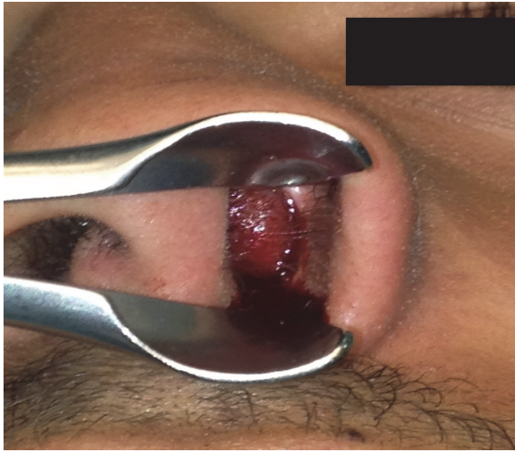
Figure 1. Nasal inspection showing the mass completely filling the left nasal cavity, almost about to exceed the vestibule, hard, covered with red-coloured mucosa, showing no pulsation, and resembling inverted papilloma

was applied. All symptoms were completely resolved after the surgery. The follow-up tomography one month after the operation was completely normal (Figure 3).