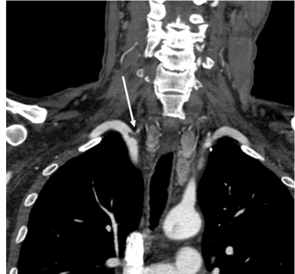
Figure 1. Thrombus located on the right subclaviovertebral arterial junction.

wide pedicle, measuring 35.4x17.1 mm (Figure 2).