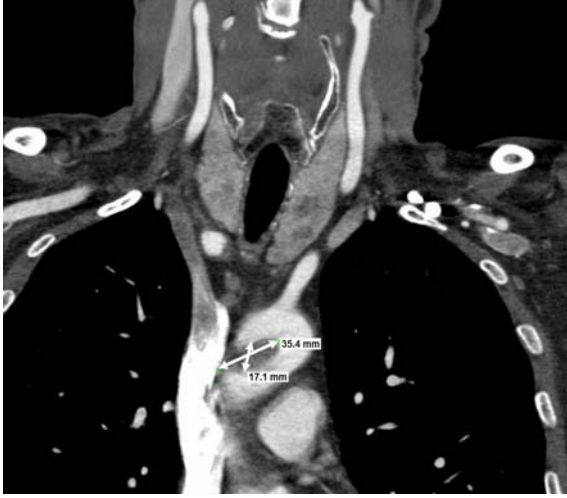
Figure 2. Thrombus with a wide pedicle located in the ascending aorta, measuring 35.4x17.1 mm

Preoperative coronary angiography was planned and anticoagulation was performed with warfarin and low molecular weight heparin. Two days later, during the coronary angiography which revealed normal coronary anatomy, we did not observe the thrombus in ascending aorta, and on the control computed tomographic angiography a remnant of the thrombus was seen in the ascending aorta, measuring 10.3 x 8.4 mm (Figure 3).