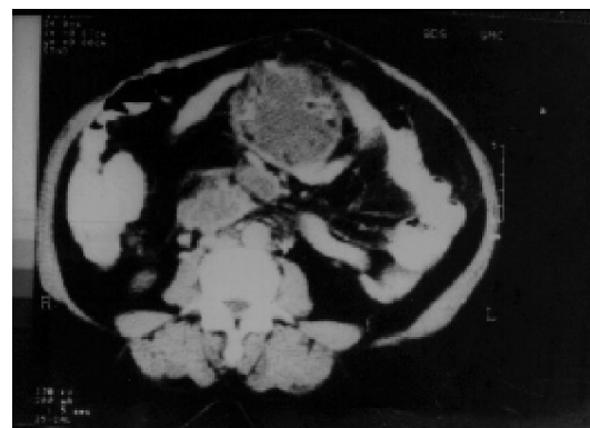
Figure 2. CT scanning of the abdomen; demonstrates resolution of the transverse colonic compression on 7th day.