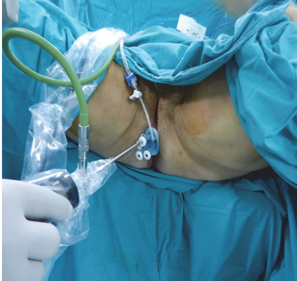
Figure 1. The application of the three-input single-port into the perianal area with sutures.

the operation. The patient was discharged on the first postoperative day. The patient's pathology reported the case to be one of high-grade dysplasia with clean surgical margins. The check-up in the 3rd postoperative month showed the colonoscopy to be normal and the patient did not have any fecal incontinence. After the rectal port usage, we did not observe any complications in this case despite the risk of anal sphincter dysfunction.