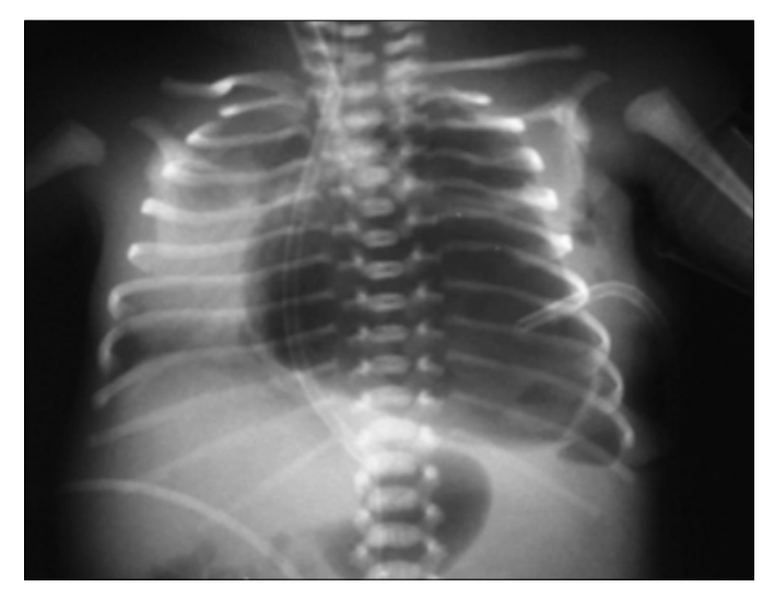
Picture 2. Radiologic appearance of the cystic lesion which leads to shifting of the mediastinum towards the right side and includes the whole left lung on PA chest graphy

Congenital cystic malformation was classified in three types by Stocker et al. (4) in 1977 based on clinical, macroscopic and microscopic criteria. Type I is the most common type (50-60%) and is composed of one or multiple cysts with a diameter of 2-10