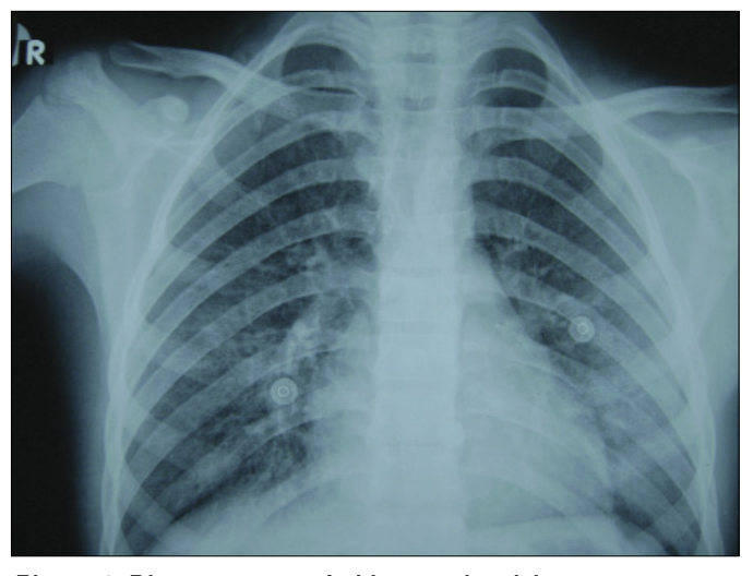
Picture 3. Disappearance of widespread nodular appearance on the lung graphy on the 14th day

The patient's FiO<sub>2</sub> was found to be 36 and PaO<sub>2</sub>/FiO<sub>2</sub> was found to be 191.6. It was learned that no vomiting occured during hanging and resuscitation. A diagnosis of ARDS was made based on the clinical status and a PaO2/FiO2 value of <200. The patient was hospitalized with diognoses of nearhanging, hypoxic cerebral edema following near-hanging and ARDS. He had insufficient sponteneous respiration. Mechanical ventilation set on SIMV mode was started in the supine position. The initial ventilator settings were as follows: the highest PEEP: 12 cmHO<sub>2</sub>, PO<sub>2</sub>: 60 mmHg. The highest PEEP became 12 cmH<sub>2</sub>O<sub>2</sub> and the highest FiO<sub>2</sub> became 100. In the follow-up, these values were reduced gradually until the oxygen saturation became 90%. For brain edema limited fluid, albumin and dexamethasone treatment was given. In the follow-up, it was observed that the patient's spontaneous respiration was sufficient and he was seperated form the ventilator on the 4th day of hospitalization. The patient's consciousness opened three days later. After the consciousness was opened it was observed that the patient could make eye contact, but had difficulty in giving responses directed to the target. His attention was