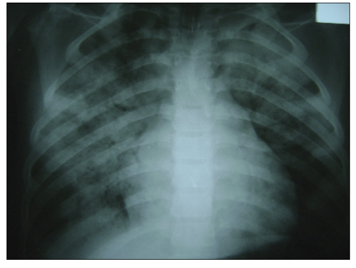
Picture 1. Widespread nodular appearance on the lung graphy on the first day

transferase: 17.8 U/L. Blood gases were as follows: pH: 7.38, PCO<sub>2</sub> 21 mmHg, PO<sub>2</sub> 69 mmHg, HCO<sub>3</sub> 12,1 mmol/L and O<sub>2</sub> saturation 94%. FiO2 was found to be 36 and PaO2/FiO2 was found to be 191.6. Renal function tests were found to be normal. C-reactive protein: 18.2 mg/L, erytrocyte sedimentation rate: 20 mm/h, prothrombin time: 18.9 s, activated partial thromboplastin time: 30 s. After one week some of the laboratory findings were as follows: creatinine kinase:466 U/L, creatinine kinase-MB: 39 U/L. lactate dehydrogenase: 1198 U/L, aspartate aminotransferase: 33 U/L, alanine aminotransferase 32 U/L, prothrombin time: 13.6 s and activated partial thromboplastin time: 26 s. Radiologic examinations revealed diffuse nodular appearance on antero-posterior lung graphy (Picture 1). Radiologic findings of the lung were observed to be improved in the follow-up (Picture 2, 3). Widespread brain edema was observed on computarized tomography (CT). Cervical CT was found to be normal. Thoracic CT revealed widespread ground