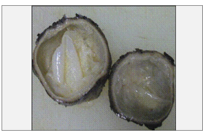
Resim 3. Kitle içinde jerminatif membran

It is difficult to diagnose primary intermuscular hydatic cyst except for endemic areas. Abscess, hematoma, soft tissue tumor and other lesions should be considered in the differential diagnosis. Biopsy should not be performed, since it would be