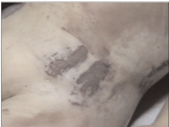
Picture 4. Skin burns in the left lower quadrant of the abdomen compatible with the metal-containing part of clothes.