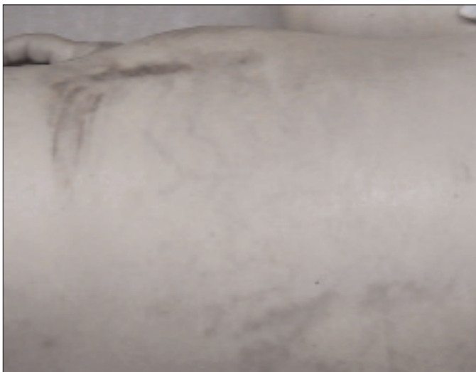
Picture 5. Fern-like appearance on the abdomen