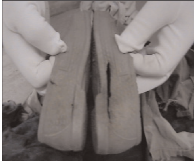
Picture 1. Appearance of tears in the soles of the shoes

(7,8). To declare that a person has died as a result of lightning strike a detailed crime scene investigation should be made in addition to external and internal examination of the cadaver. The weather conditions in the place and the time of the event and clues about the effects of lightning in the surroundings (parts of clothes scattered around the place, damage in houses and trees, mass animal deaths in sheep and lamb herds)