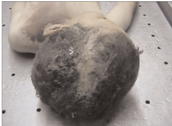
Picture 2. Burns in the scalp hair and burnt areas in the scalp