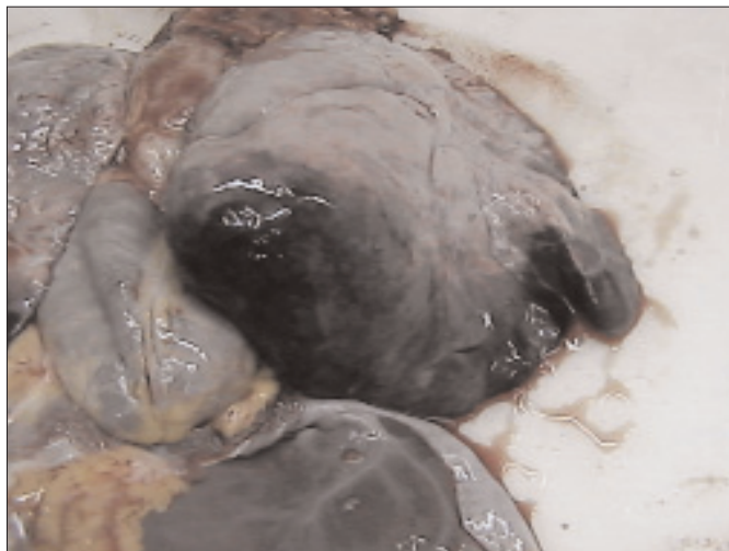
Picture 7. Hemorrhage areas in the lung which were visualized macroscopically during the autopsy.

should be investigated (2). Clothes may be ripped, torn or unstitched (9,10). The fact that all clothes and the shoes of this subject were ripped and lightning was observed in October on a rainy and closed weather was found to be compatible with the information in the literature.