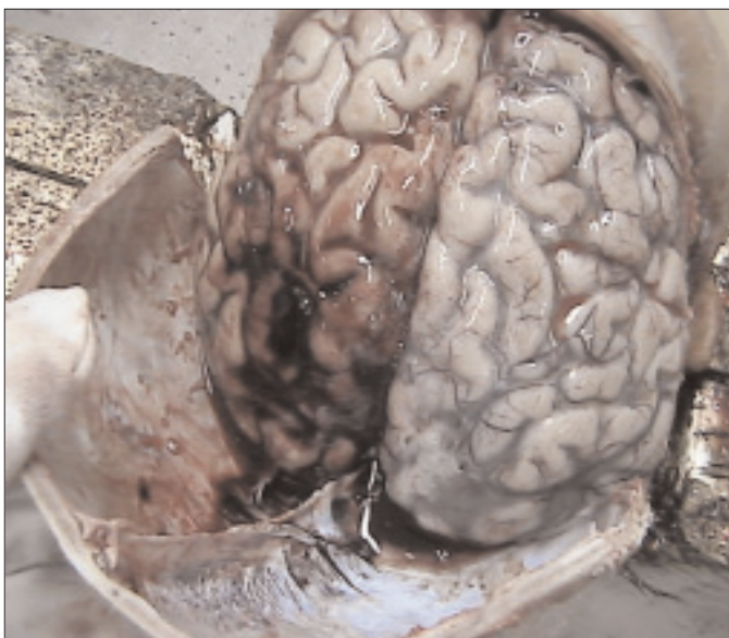
Picture 6. Subarachnoid hemorrhage areas in the brain which were visualized macroscopically during the autopsy.