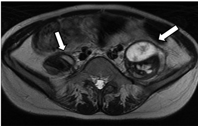
Figure 1. T2A hyperdense lesions localized in the psoas muscles bilaterally (larger in the left).

Extrapulmonary tuberculosis cases have increased in the last ten years with the increase of individuals with