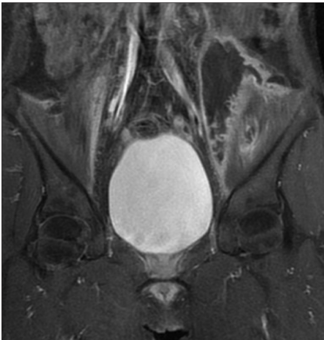
Picture 2. Fusiform mass lesions localized in the psoas muscles bilaterally extending along the iliac and iliopsoas muscles with peripheral contrast uptake

immunosuppression and emergence of drug-resistant bacteria (4,5). Our patient had no individual or familial history of tuberculosis or immunosuppression.