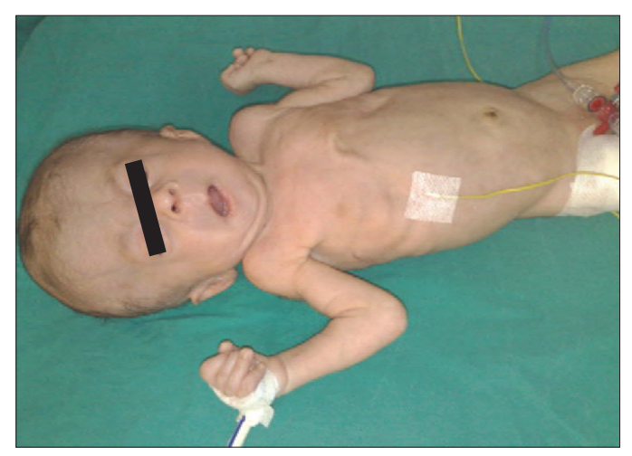
Picture 1: General appearance of the infant diagnosed as Edward's syndrome

cranial magnetic resonance imaging revealed occipital meningocele, thinning of corpus callosum, Dandy Walker variant; chest tomography revealed high left diaphragma and esophageal graphy with barium revealed esophageal atresia. Other laboratory tests were found to be normal.