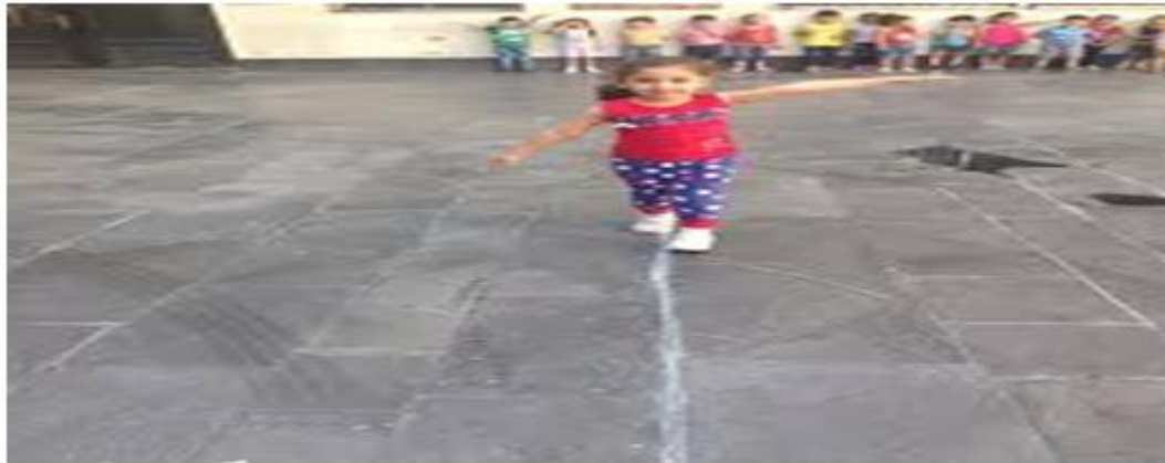
Figure 1. Shows how the foot-behind-the-foot walking is performed