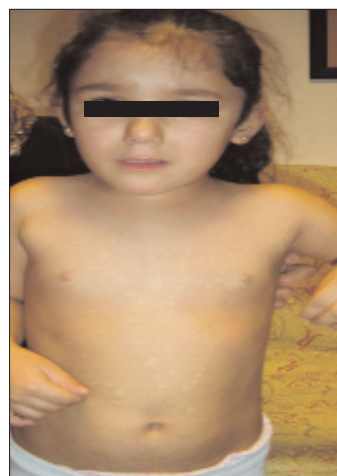
Figure 2. Patient at five years of age