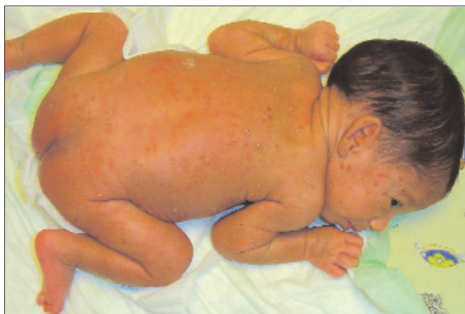
Figure 1. Skin findings of the patient on the 10 th day of life

eosinophilic cytoplasm some including notched nuclei or nuclei in the form of a kidney and extending to the epidermis was observed in the superficial dermis and in the pustule. Immunohistochemical examination revealed S100 positivity and nonspecific background staining and findings were found to be compatible with LCH. For screening systemic diseases complete blood count, complete urinalysis, biochemical tests, coagulation tests, abdominal ultrasonography and bone screening was performed and was evaluated to be normal. On follow-up, skin lesions improved spontaneously leaving hypopigmented scar in the 3 rd month. On the 4 th month follow-up, tachycardia and arrhythmia was found and other systems were found to be normal. Electrocardiographic examination revealed ventricular premature beats and atrioventricular dissociation (Figure 1). Bone marrow examination, echocardiography, bone screening, cranial magnetic resonance imaging (MRI) and biochemical tests repeated for screening systemic diseases were found to be normal. Arrhythmia was improved spontaneously without treatment. Our patient is 5 years old now and no other problem developed in the follow-up (Picture 2).