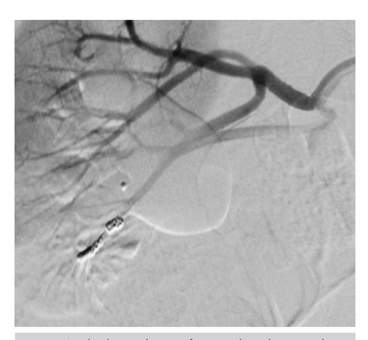
Image 3. The last angiogram after procedure shows complete embolization of angiomyolipoma and coil plugs in the inferior pole of the kidney to ensure that no blood supply would feed the embolized lesion.