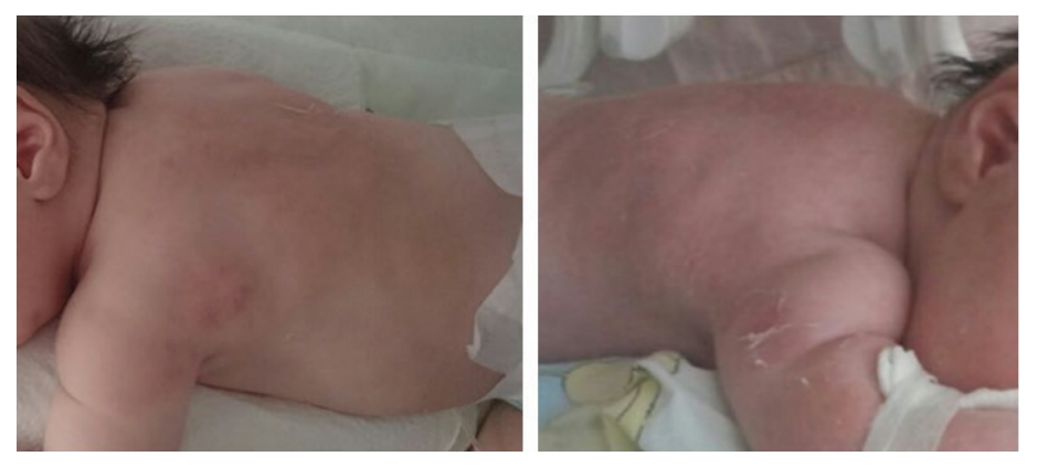
Figur 1: Demonstrations of nodular, erythematous lesions in an infant with subcutaneous fat necrosis. Lesions are more prominent in his shoulders and back.

commenced. The patient was breastfeeding, so no other nutritional restriction was necessary, apart from eliminating vitamin D supplementation. Following hyperhydration, four doses of intravenous furosemide (1mg/kg/dose) and two doses of methylprednisolone (0.05 mg/kg/dose) were applied in a total of 6 hours, and the calcium level was still 21.5 mg/dl. Intravenous pamidronate sodium (1 mg/kg/dose) was given by infusion over four hours. After twenty-one hours, with a calcium level of 18.2 mg/dl, the second dose of pamidronate was infused (1 mg/kg/dose). The steepest declines in calcium levels were achieved following the pamidronate infusions (Figure 2). The calcium level was normalized (9.8 mg/dl) on the fourth day following the second dose of pamidronate. The calcium levels were regularly monitored and the child had no hypocalcemia after pamidronate treatment. Bilateral nephrocalcinosis was detected in the renal ultrasonography. The urinary calcium/creatinine level was 0.23 on the fifth day of treatment. Furosemide and methylprednisolone therapies were gradually stopped. The parathyroid hormone level was as low as 2.8 pg/mL (N: 15-60) when the serum calcium level was 22.7 mg/dl and the 1,25-dihydroxy vitamin D (1,25-OHD) level was 60.9 ng/ml (N:24-86). 25-hydroxyvitamin D (25-OHD) level