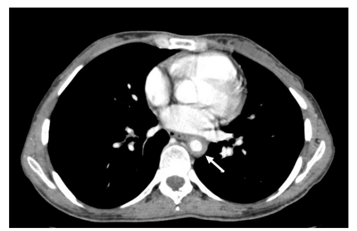
Fig. 2. Thorax CT axial images with iodinated contrast enhancement demonstrated diffuse wall thickening and about 40% luminal narrowing in the descending aorta