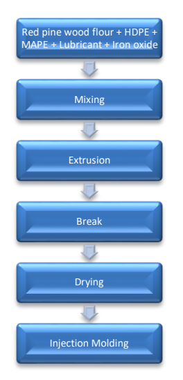
Figure 1. Composite manufacturing workflow.

Pre-Processing Samples: Before painting processes, some pre-treatments were carried out on WPC plates to determine their effects on their painting performance. These pretreatments are mechanical etching, chemical etching (diluted acid treatment), ultraviolet (UV) light and microwave applications.