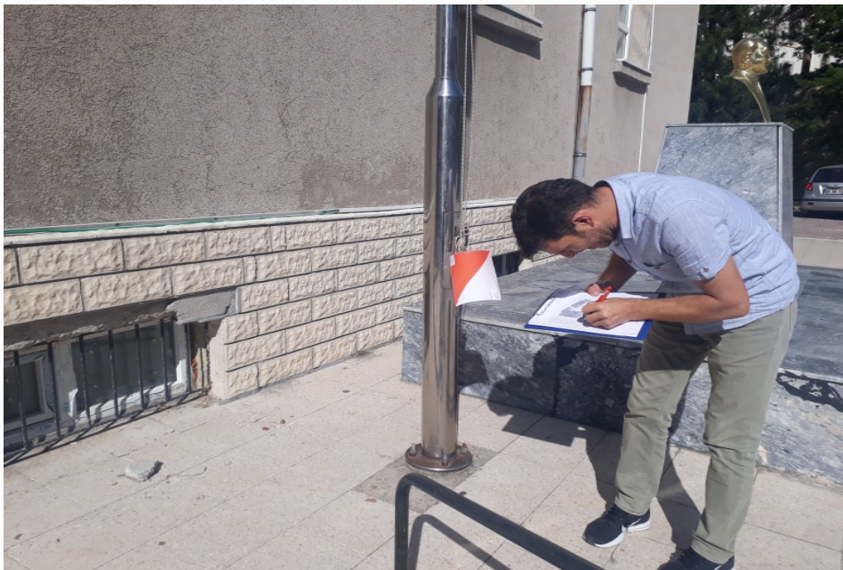
Figure 3. In -service training orienteering practices