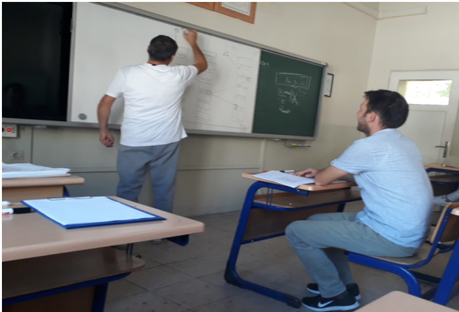
Figure 1. In -service orienteering training

Before preparing the practice materials, the researcher received a 30-hour in-service orienteering training given by the MoNE, and learned how to prepare and apply the materials.