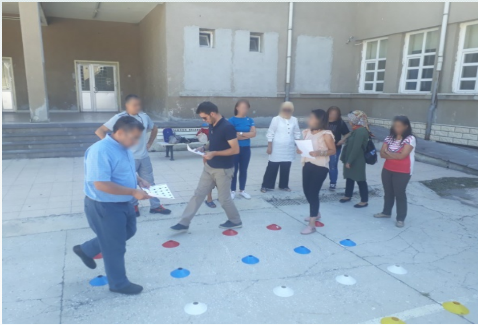
Figure 2. In -service training orienteering practices