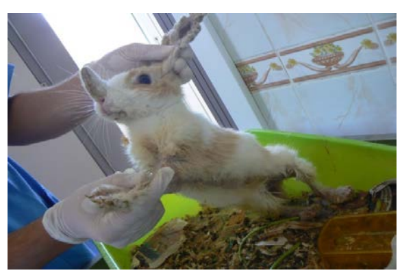
Figure 1. Mass on the muzzle, severe crusting on pinnae and paws, gryposis and alopecia on abdomen.

In addition to the horn like mass on muzzle, severe crusting on pinnae and paws, gryposis, alopecia and erythema on the abdomen and tail were detected in macroscopic examination (Figure 1). Scrapings colleted from the lesions were put into 10% of KOH for 2 h. Sarcoptes scabiei and C. parasitivorax were identified according to their morphological pecularities in microscopic examination<sup>11</sup>.