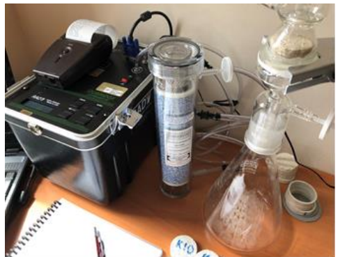
Figure 1. Zeolite Filter Radon Test Device RAD7.

In this research, zeolite-based mineral composite filter was prepared and experiments were made to remove radioactive gaseous waste. Zeolite filters are prepared in 10 mm thickness and 45 mm diameter. Radon gas is used to represent radioactive gases. Radon gas retention performance of the mineral-based composite radon filters were determined. Laboratory tests were performed to determine effects of the additive ratio on the filter performance. Composite zeolite filter samples were prepared for this research (Figure 1).