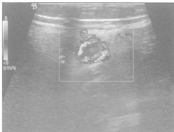
Figure 1b. Transverse Doppler US shows increased vascularity of the appendix.

Patient has been under a control program for 9 months and has not had any suffering for this subject, till then.