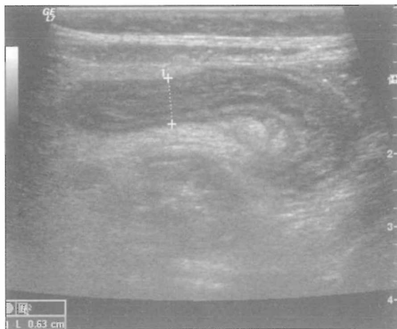
Figure 2b. Longitudinal US evaluation of the appendix in the third day.