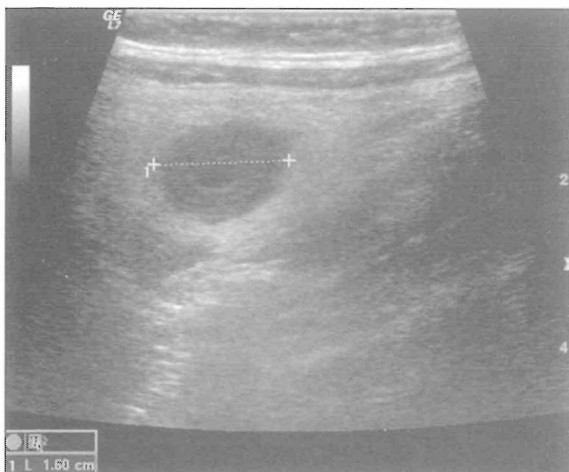
Figure 1a. Transverse US scan shows appendix that is 16 mm in thickness.