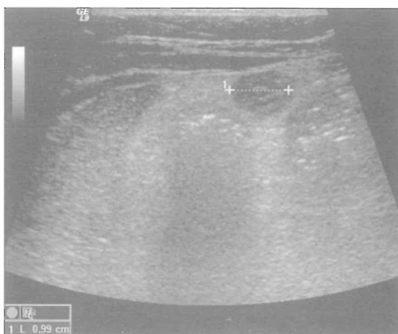
Figure 1c. Transverse US shows 9 mm appendix thickness in the second day.