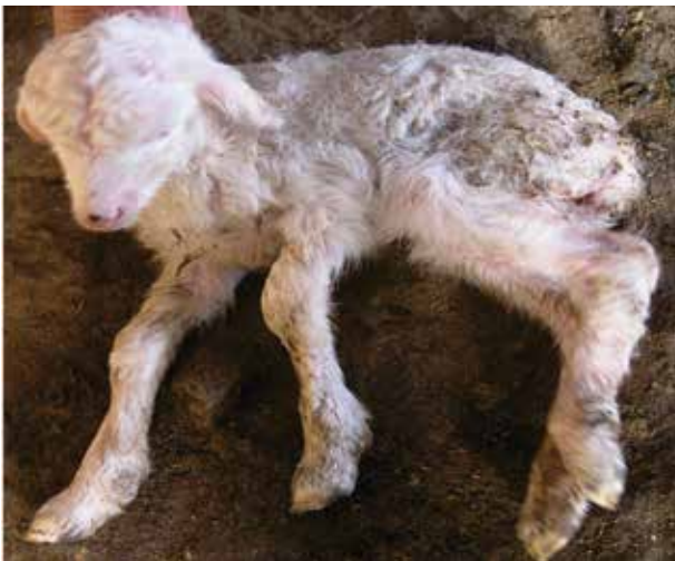
Figure 1. BDV infected lamb with paralysis and hairy shaker. Şekil 1. BDV enfekte bir kuzuda paraliz ve düzensiz yapağı örtüsü.

The dominant gross lesions in the non-nervous tissues were thymic hypoplasia and abnormal fleece with long and straight birth coats called as "hairy shaker" (Figure 1). The tonsils and lymph nodes were edematous and enlarged, some of which were hemorrhagic. In two lambs (case nos. 2 and 3), there were petechial hemorrhages on the lateral and ventral surfaces of the tongue. The intestinal lesions consisted of a diffuse congestion, the contents of which were often fluid in newborn lambs and kids. Two lambs (case nos. 22 and 23) had erosive-ulcerative lesions with hemorrhages in the oral and intestinal mucosa. In three animals (case nos. 1, 22 and 23), the cranial lobes of the lung had small or extensive dark red areas of hepatisation and emphysema with leakage of yellowish fluid from the cut surface. In three lambs (case nos. 2, 3 and 15), there were petechial hemorrhages in the mucosa of the urinary bladder.