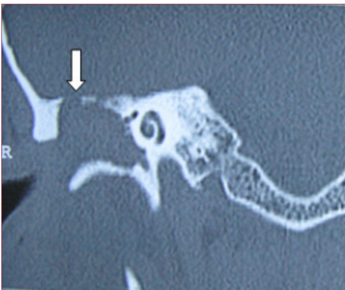
Figure 3. CT image. Dural bone defect (tegmen tympani), the white arrow (Coronal section, right ear)