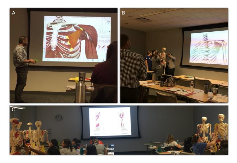
Figure 1. Occupational Therapy Anatomy Class Utilizing 3D Anatomy App. A) Professor explains the pectoralis minor muscle from an anterior view using Apple iPad Pro and 3D Medical App projected on the screen, B) Students finding the thoracic and shoulder skeletal structures shown with Apple iPad and 3D Medical App projected on the screen, and C) Students working with the skeletal models meanwhile the powerpoint shows the forearm's deep muscles.

As support for the lecture component and models, 3-dimensional animations ("Complete Anatomy" app, on an Apple iPad Pro) of different anatomical upper extremity structures were projected on large screen for students to visualize and improve their understanding of the anatomy content that would be covered during lecture and laboratory, as seen in Figure 1. The app was used to show students real-time muscle movement, insertion & origin, bony surfaces, and landmarks, along with nerve and blood supply of the upper extremities. Additionally, to enhance student comprehension of upper extremity anatomy and involvement, the virtual dissection tools were utilized during lecture as well as while examining on the pre-dissected cadavers.