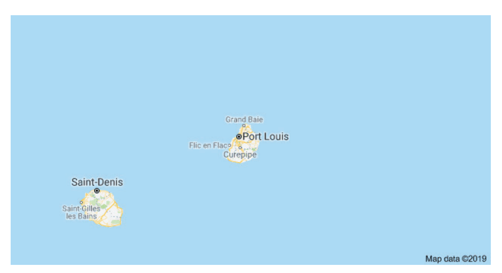
Figure 2: Mauritius Map<sup>113</sup>