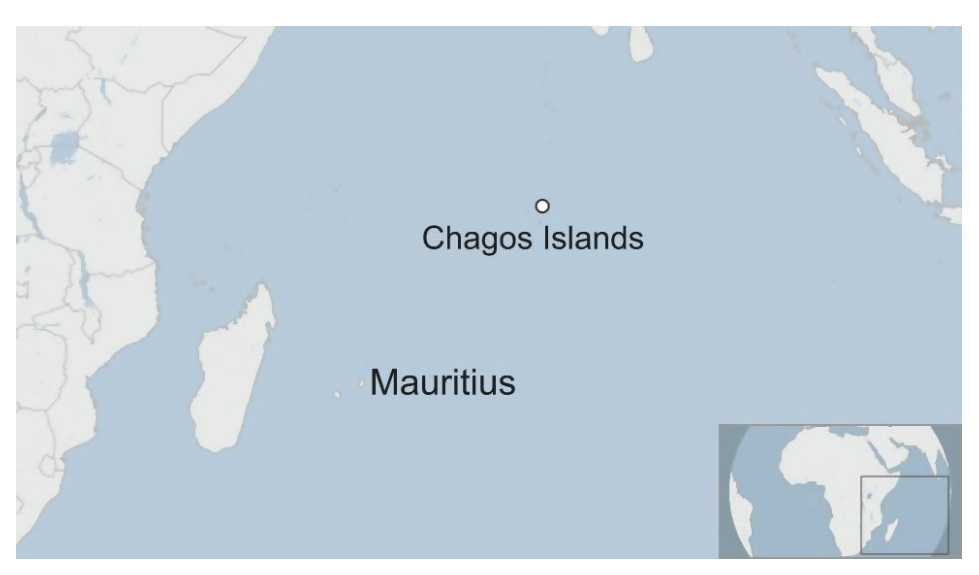
Figure 1: Mauritius and Chagos Archipelagos Location in Indian Ocean<sup>112</sup>