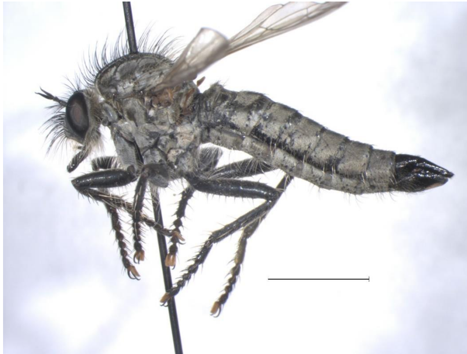
Figure 2. Female of Dismachus praemorsus