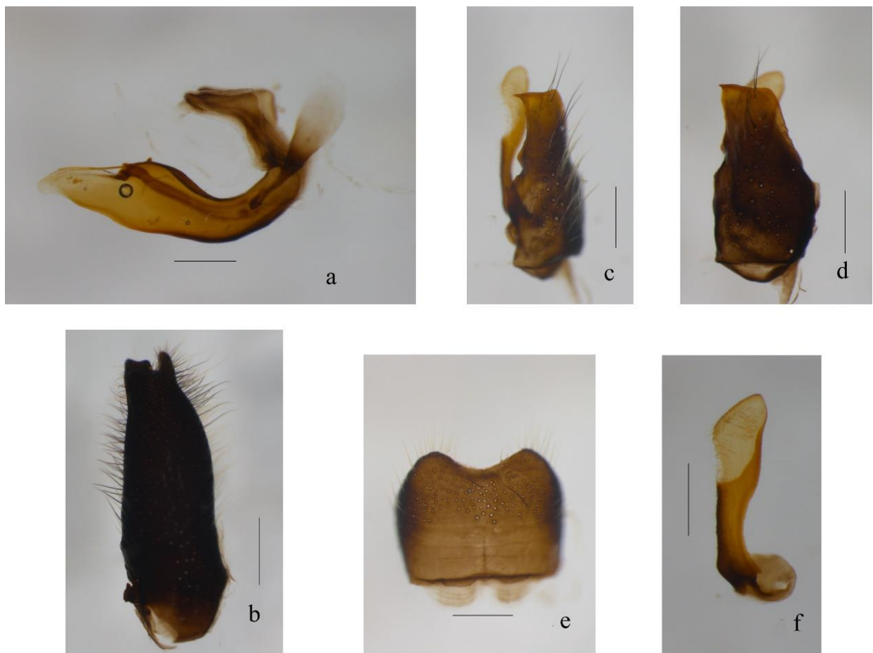
Figure 4. Male genitalia of Dismachus praemorsus a) aedeagus, b) epandrium, c) side view of gonocoxite and dystistylus, d) gonocoxite, e) hypandrium, f) dystistylus

D. praemorsus individuals were caught on the grass in grassland, forest edge or clearing areas in the forest, on the sides of the field, Perching on the stems of the grasses, and especially egg-laying behavior in the spikes of the Poacea members were observed. Table 2 shows the meadow plant species in sampling area