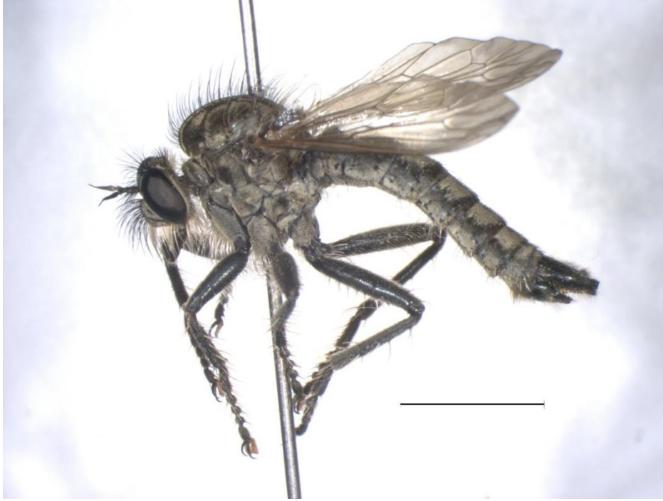
Figure 1. Male of Dismachus praemorsus

Distribution in Turkey: Erzincan, Cevizli, 04.08.1990, Erzurum, Merkez, 01.06.1971, Atatürk Üniversitesi, 23.07.1990, 27.08.1990, Palandöken, 17.07.1990, Oltu-Uzunoluk, 19.07.1992, Olur-Süngübayır, 13.07.1992, Pasinler, 14.08.1992, Senkaya-Turnalı, 03.07.1990, Tortum, 04.07.1991, [2]; Ankara, [8]; Eskişehir, İnönü, Uludere, 27.05.2001 [3]; Ağrı, Tutak, Suluçam, 26.06.1993, Bitlis, Tatvan, 30.06.1993, Tatvan, Karakurt, 01.07.1993; Kütahya, Sobran, Porsuk barajı, 08.07.1993, Van, Karasun Brige, 29.06.1993 [4].