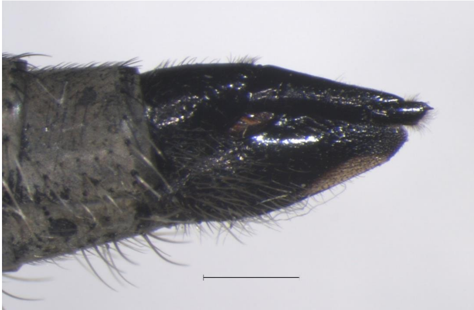
Figure 3, Female ovipositor of Dismachus praemorsus