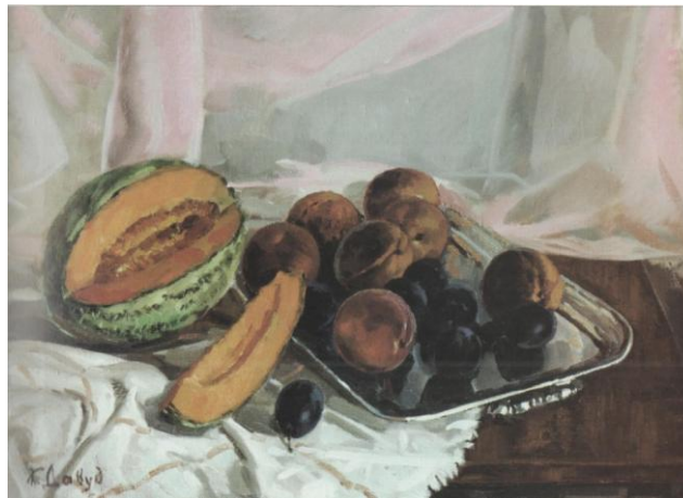
Photo 1. Melon and fruits, 1988, canvas, oil. 50x70 cm..