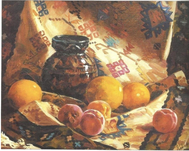
Photo 2. "Eastern still life", 1980, kətan, canvas, oil. 70x90 cm..