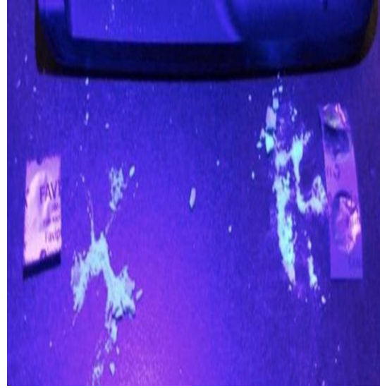
Figure 2. UV light appearance when favipiravir tablet breaks.

three cases who had refused to take medication were the cases who did not show any fluorescence. Five cases were treated only with hydroxychloroquine and one case with both favipiravir and hydroxychloroquine, two of the former and the latter showed fluorescence. Two cases did not fluoresce although they had been treated with hydroxychloroquine 3 and 7 months ago. Eight patients with actual or previous favipiravir treatment did not show fluorescence, one of them was on the first day and first dose of induction, the remaining seven cases were on the 5th-17th days of or after favipiravir (Figure 1, 2).