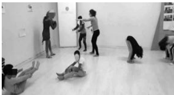
Figure 2. 'Mirror' activity

It was positive that during 'Mirror activity' (figure 2) -which did not involve touching- since we decided to use lottery 5 , boys and girls actually collaborated together to manage the goal instructed, e.g. S3 – S7, S12– S6, and S11- S14. For S3 and S7, it was the first time they worked together doing an activity.