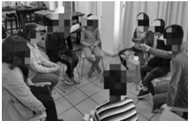
Figure 8. 'I am, I have, I want' activity

Through 'I am, I have, I want' activity students expressed themselves anonymously or in an eponymous manner. They were given freedom to write anything they wished, and they later shared (or not) with the whole group. During 'I am, I have, I want' (figure 8) activity S6 wrote in the 'I am' box 'I am ugly'. Since she did not share this statement openly in the group, we all wondered who thought that of himself/herself. S13 -who has a very good self-image- wondered particularly about it.