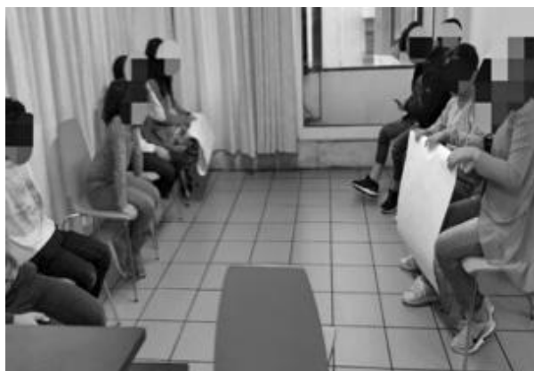
Figure 9. 'I pay attention to what I say' activity