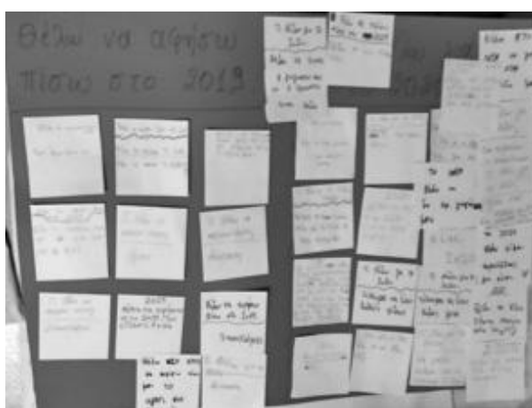
Figure 10. 'What I wish to have/acquire the new year and what I wish to leave back for the past year' activity

Generally, across all activities and lessons students were highly involved. This was a very positive outcome noticed in this circle. After the completion of the third circle students completed the sociometric test they had taken before the DiE intervention. According to students' nominations 6 , there has been a rise for both most of the friendship and neutral ratings. And the important information is that even for students who did not have both prices increased, either the friendship or neutral price noted indeed a raise. The most remarkable result, is the prices noticed for exclusion rating ('Never like to play with'), which noted a decrease for all students apart from one who was picked up once in both tests. In general, there changes in nominations/percentages: a rise for a friendship rating and a decrease for an exclusion rating (10 in total) versus a decrease for a friendship rating and a rise for an exclusion rating (8 in total). In both cases, nominations of chosen students do not vary importantly; and there is noted a slight difference that varies only by one person. The most remarkable comment here is S6 who having zero nominations in the pre-AR test collected three nominations in post-AR test.