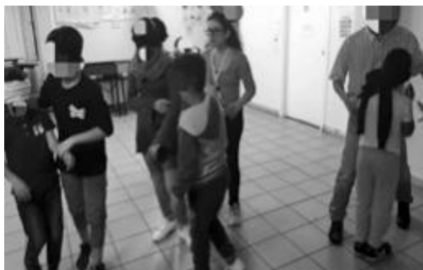
Figure 3. 'Guide the blind' activity

In addition, in 'Falling inside the circle' trust activity boys were falling at boys' side and girls at girls' side. The 'Circle of emotions' (figure 4) activity gave the students the opportunity and space to look into their emotions, write them down and express them to their peers. The easiness or not with which students wrote about their feelings and shared at small pairs or to the whole group provided us with important information about students' emotional status. We were very surprised by the number of students who wanted to share their 'circle of emotions' in the whole group and the whole-group involvement.