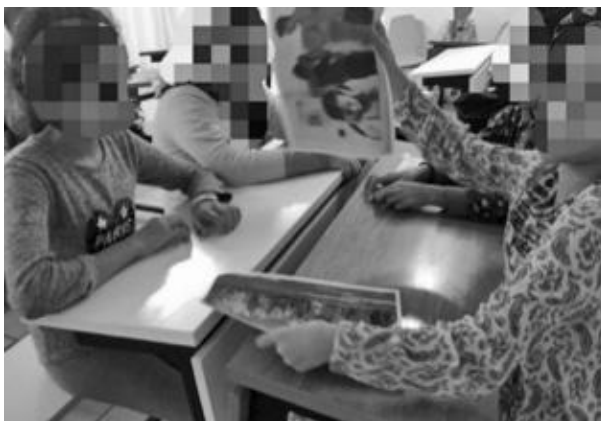
Figure 5. 'Living with the others' activity

During Circle B students were very actively involved in the activities; they drew from their experiences and they shared their opinions and their ideas about the pictures we discussed with the whole group (figure 5).