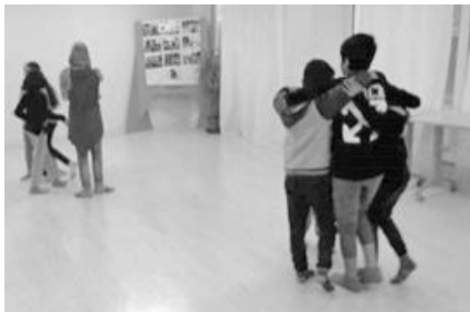
Figure 1. Walking activities

which was creating a more intense atmosphere rather than the relaxed and concentrated one we wanted to achieve. Concerning students' relationships, it was noticed that they had several conflicts and bullying behaviors towards each other. During walking activities when they had to create small teams, students were only picking up their male or female friends respectively. Generally, boys were more intense and assertive about forming the groups they desired (figure 1).