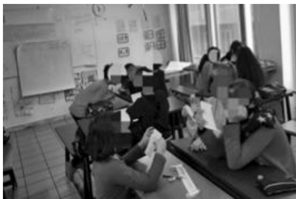
Figure 6. 'Words that wound' activity

Later, they had the chance to repeat the activity 'Corridor of consciousness' after having watched the short film 'The birds' and written down birds' emotions in two teams; they then spoke in the two teams created, as if they were the heroes (big bird and small birds) of the story. Through drama the two teams expressed their ideas and their feelings based on the character they adopted.