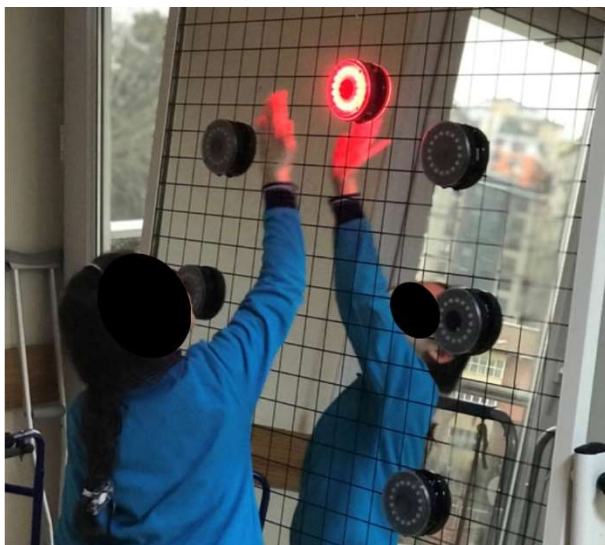
Figure 4. Upper limb training with visual feedback device.

therapy whereas the study group received usual therapy (for 35 minutes in each session) and add-on intervention. Add-on intervention was VFT with Cogniboard® Light Trainer device (for 10 minutes in each session) and the usual therapy consisted of NDT-based rehabilitation program.