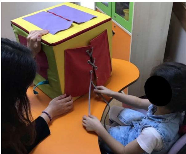
Figure 3. Upper limb training with passing a shoelace through the holes.