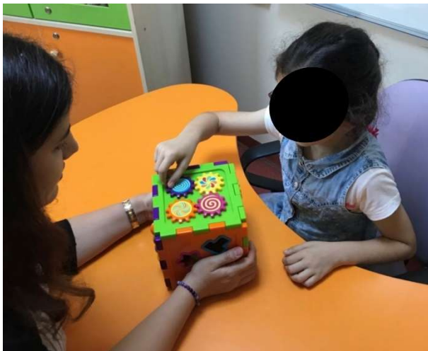
Figure 2. Upper limb training with turning impellers.