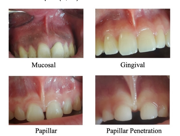
Figure 1. Anatomical MMLF type classification according to the Mirko et al. (13)

early ages, it becomes thinner and smaller with time (4). With the eruption of the permanent teeth and increased growth of the alveolar process, this attachment completes its maturation process and may vary in size for each individual (9). MMLF abnormalities may be seen in the oral cavity due to several causes (4,10,12). injuries to jaw and face in the early childhood may cause MMLF abnormalities as well as various syndromes which can cause malformations and gingival diseases (4). Ehler-Danlos syndrome, Ellis-Van Creveld syndrome, Infantile Hypertrophic Pyloric Stenosis and Holoprosencephaly are one of the many syndromes associated with abnormal frenum (4,10). Abnormal frenum might also be seen in healthy individuals without syndrome and it is known that it may cause several clinical problems. It is reported that when the frenum attachment level is too close to the gingival margin, it may cause gingival recession because of the muscle pull (9,11).