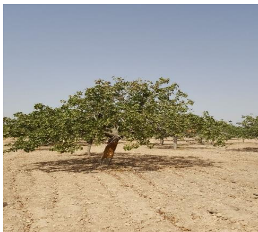
Figure 1. Artificial overwintering shelters established on pistachio trees.