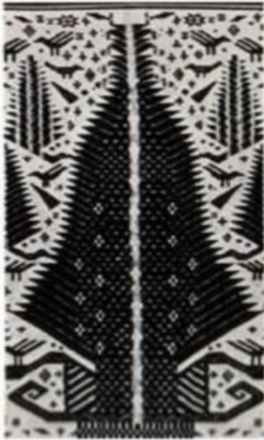
Figure 5. A Carpet motif designed by Asian Turks

designs and themes of the handwoven carpets among their renowned artworks (s. Figure 5).