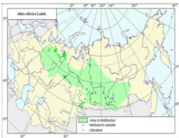
Figure 2. Distribution of the Abies sibirica in Sibiria (Agro Atlas, 2009)

Genus Abies habitaded erect narrow pyramidal. Abies sibirica grows 30-35 m tall with a trunk diameter of 0,6-1 m and a conical crown (Conifer Specialist Group) The leader is seem upright and rigid against the sky. The tree lives in the cold boreal climate on moist soils in mountains or river basins at elevations of 1900 - 2400 m. It is very shade tolerant, frost resistant, and hardy, surviving temperatures down to -50 0C (IUCN, 2006).