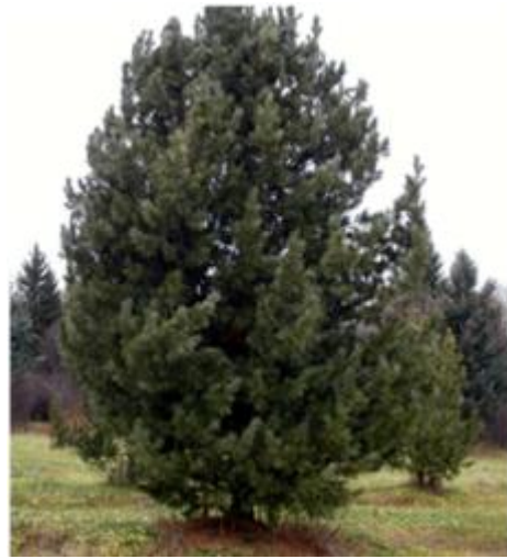
Figure 3. A view of Pinus sibirica

Genus Abies habitaded erect narrow pyramidal. Abies sibirica grows 30-35 m tall with a trunk diameter of 0,6-1 m and a conical crown (Conifer Specialist Group) The leader is seem upright and rigid against the sky. The tree lives in the cold boreal climate on moist soils in mountains or river basins at elevations of 1900 - 2400 m. It is very shade tolerant, frost resistant, and hardy, surviving temperatures down to -50 0C (IUCN, 2006).