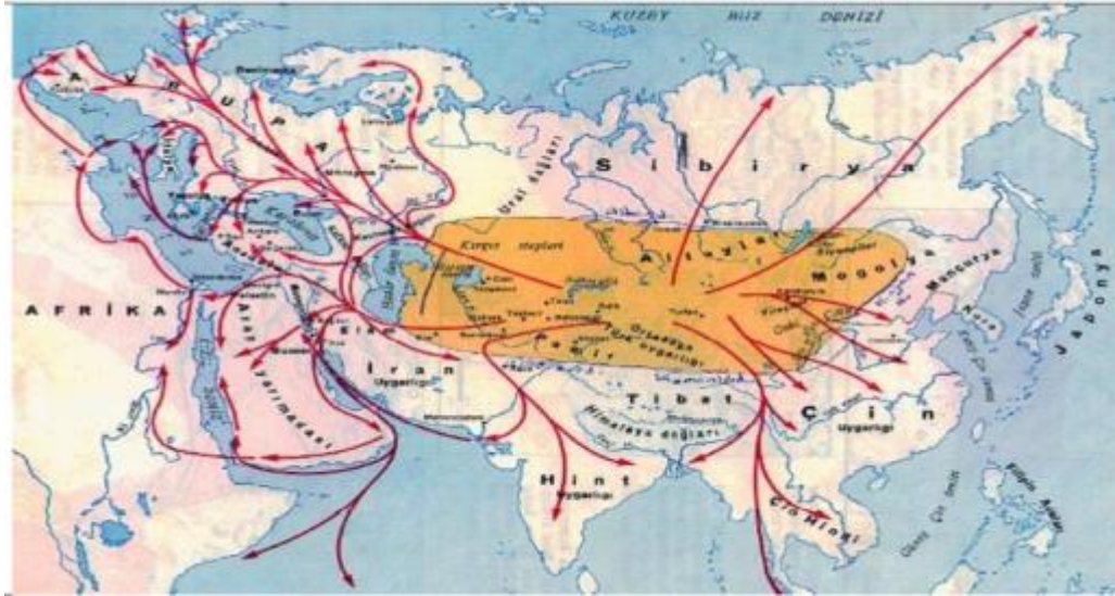
Figure 4. The Central Asian region where the Turkish communities intensively lived, and their routes of migration

at the south of the Altai region (Reux, 2000). It is understood that the shamanist Turks of the Siberian Taigas continuously moved southwards, towards the steppes. In conclusion, the Turks intensively lived in, and spread over the world from the Altai Mountains and around the Baikal Lake (see Figure 3).