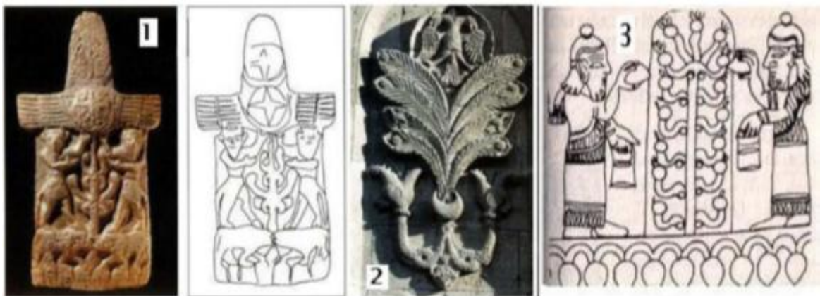
Figure 7. Life trees in Anatolian Culture