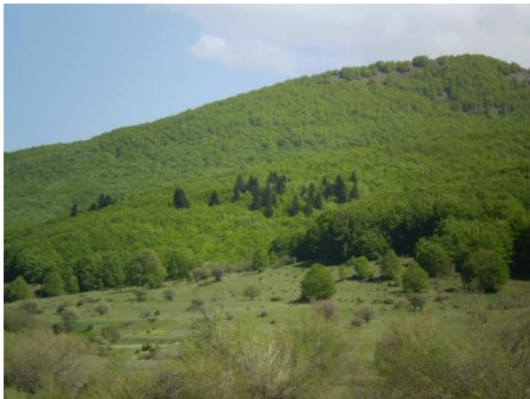
Figure 2. Expansion of Abies borisii-regis Mattf. in ass. Calamintho grandiflorae-Fagetum Em 1965, National Park Mavrovo, Republic of Macedonia (2010)

Beech-fir forest communities (ass. Abieti-Fagetum macedonicum Em /1962/ 1985) in the Republic of Macedonia settle expressed mesophilic sites in the zone of beech forest region of 1100 to 1600 m a.s.l. Forests are densely assembled (canopy closure). Beech-fir forest communities are characterized by clearly marked floral structure. The floor of trees is in dominance of Fagus sylvatica ssp. moesiaca Malý (Balkan beech) and Abies borisii-regis Mattf. (Macedonian fir). The floor of shrubs is mostly characterized by shade tolerant species.