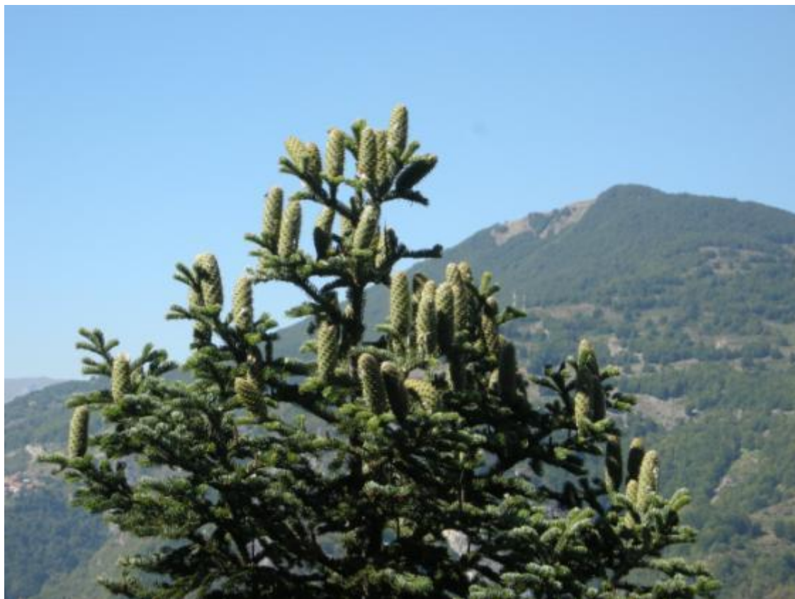
Figure 1. Large fruitfulness of Abies borisii-regis Mattf., mountain massif Bistra, Republic of Macedonia (2010)

In the struggle for light in natural successive processes the fir manages to overcome many species, particularly the beech as a shade tolerant species too (in high density beech forests the fir's offspring successfully adapt to site conditions). Concerning some of the heliophile species which thrive with the fir at higher altitudes, such as some oaks, pines, spruce, the fir has overwhelming power to develop and grow above their canopy, particularly when the forest cover is dense. This is very important because the expansion and the destruction role of the fir refer to fir related forests composed of these species as edificatory. During the conducted field research period (2010-2012), in all communities where fir is found in the upper part of the crown shows large fruitfulness (Figure 1); fertile branches are literally packed with cones with seeds, especially within the boundaries of the