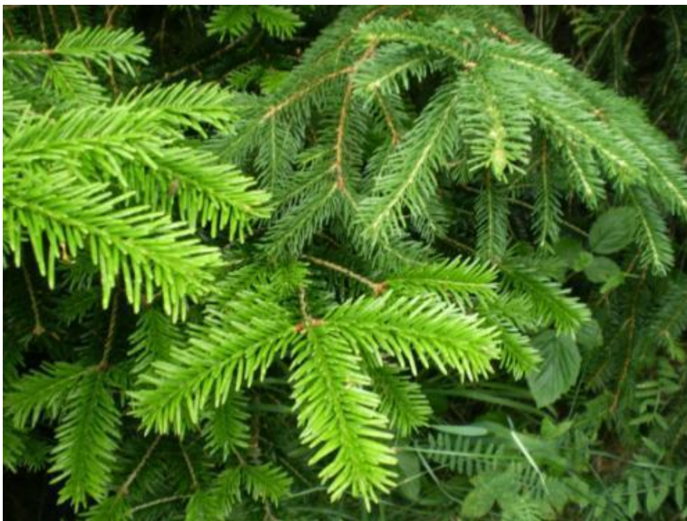
Figure 4. Aggressive competition of fir's offspring despite Picea abies Karst. in ass. Abieti-Piceetum scardicum Em /1958/ 1985, mountain massif Šar Planina, National Park Mavrovo, Republic of Macedonia (2010)

European barberry, Berberis vulgaris L. (Acevski and Simovski, 2010, 2012; Simovski, 2011).