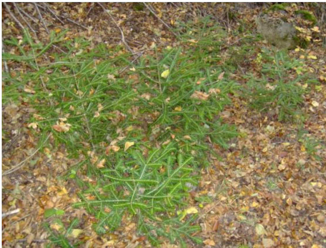
Figure 3. Offspring of fir in ass. Abieti-Fagetum macedonicum Em (1962) 1985, mountain massif Bistra, Republic of Macedonia (2008)